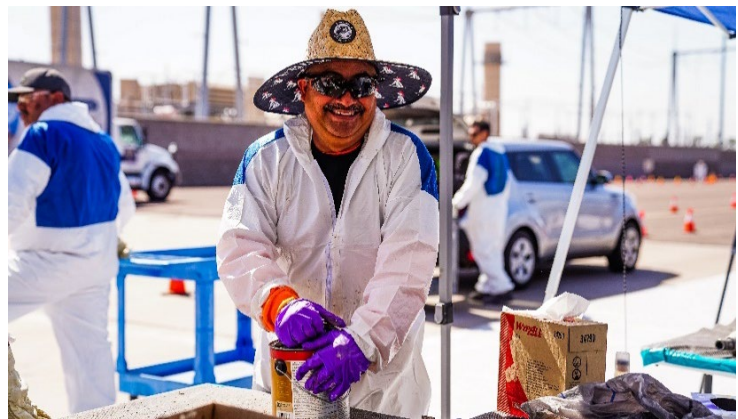
The hazmat worker is bulking latex paint.

Tempe’s Municipal Utilities Department played host to the 45th Zero Waste Day on July 29. This event provided residents a means by which to donate usable items to local organizations for reuse, recycle items not accepted in the recycling container and dispose of household hazardous waste properly.