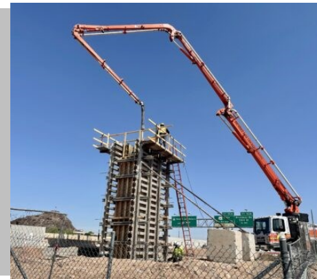
Alameda bridge construction

Prior to Western Canal bridge construction, we will hold a construction update meeting for the adjacent neighborhood.