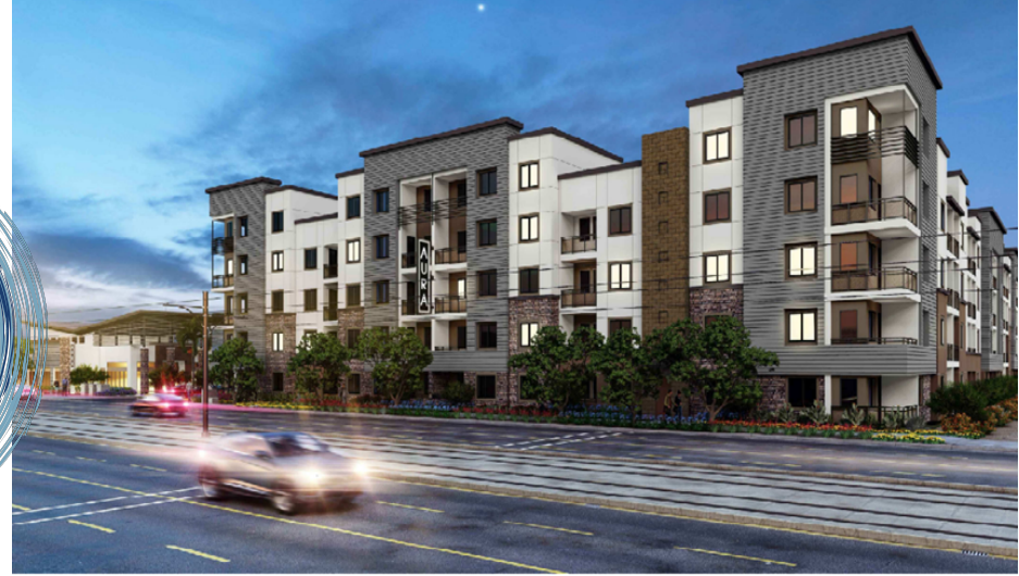
Aura on Apache - 1830 E Apache BLVD