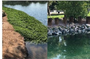
LAKE EDGE OPTION E - NATURAL / RIVER ROCK