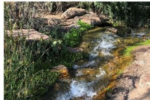
WATER FEATURE OPTION AA - STREAM (IF FUNDING IS AVAILABLE)