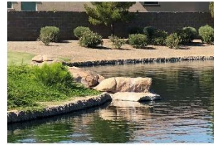
LAKE EDGE OPTION B - TEXTURED CONCRETE