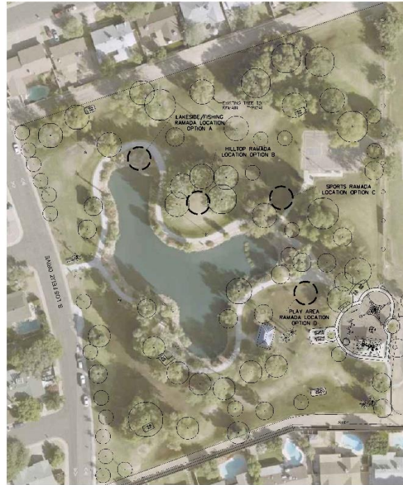
SELLEH PARK SITE PLAN AND RAMADA LAYOUT LOCATION OPTIONS