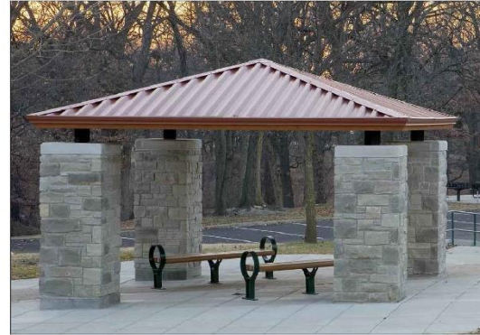
STONE VENEER FINISH