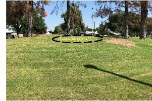
RAMADA LOCATION OPTION B