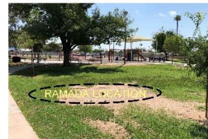
RAMADA LOCATION OPTION D