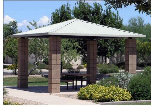
SCORED CMU BLOCK FINISH