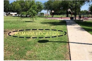
RAMADA LOCATION OPTION C