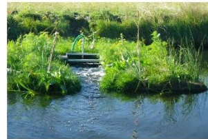
WATER FEATURE OPTION BB - FLOATING STREAM (IF FUNDING IS AVAILABLE)