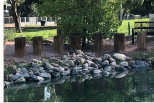
LAKE EDGE OPTION C - RIVER ROCK