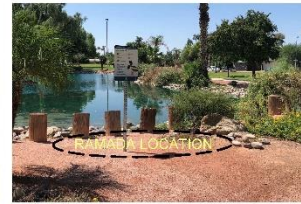
RAMADA LOCATION OPTION A