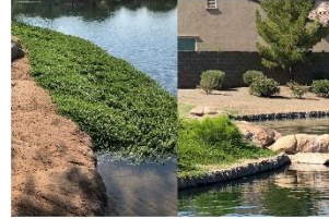
LAKE EDGE OPTION D - NATURAL / TEXTURED CONCRETE