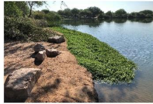
LAKE EDGE OPTION A - NATURAL