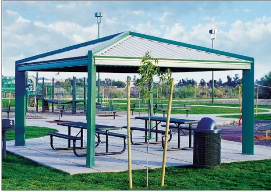
METAL POST FINISH