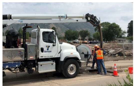
Tempe Municipal Utilities employees Robert Rascon and Raul Luna vacuum and clean a storm drain line in Flagstaff, Arizona.