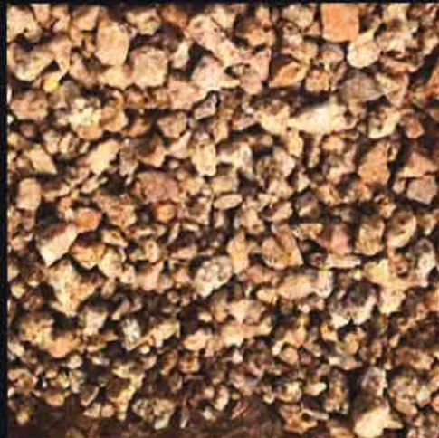
Madison Gold - Cutting Edge Curbing cuttingedgecurbing.com