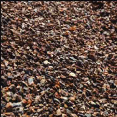
Madison Gold Rock | Ewing Landscape ... ewinghardscape.com