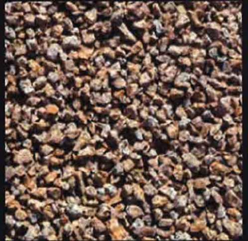
Madison Gold Rock | Ewing Landscape ... ewinghardscape.com