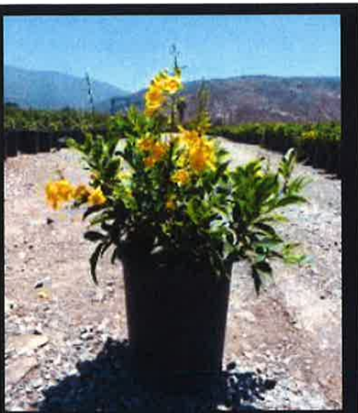
Tecoma stans, Yellow Bells or Esperanz...