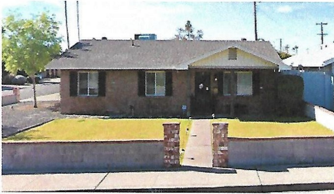
OAK - 1706 N Bridalwreath St