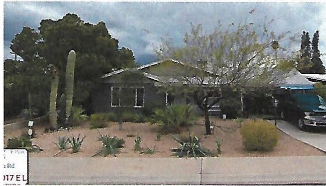
PISTACHE – 1017 E Larkspur Ln