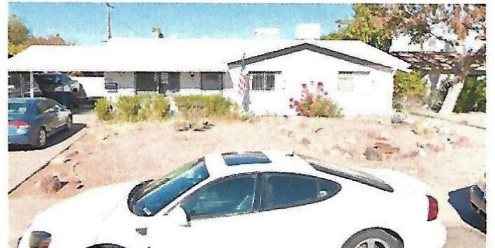
OAK – 1028 E Lilac Dr