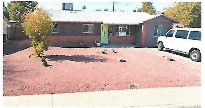
FRUITLESS OLIVE - 1638 N Camellia St