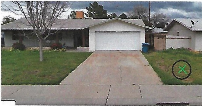
BONITA ASH – 1721 N Daffodil St