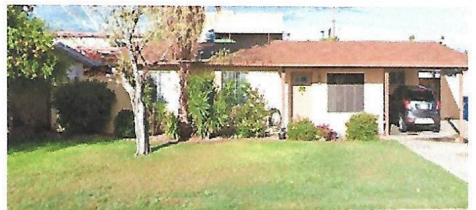
FRUITLESS OLIVE - 1532 N Oleander St