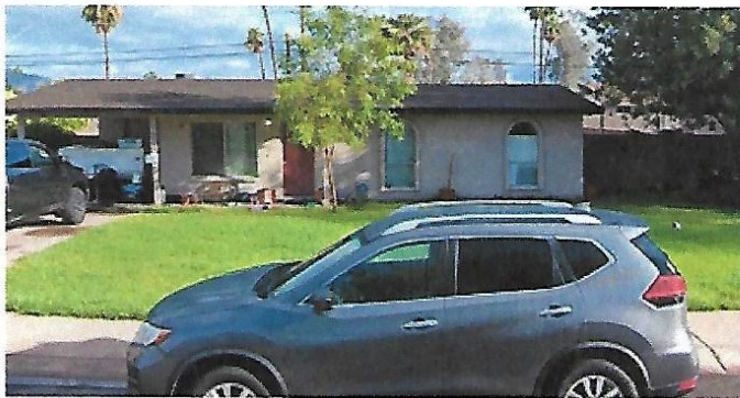
(2) PISTACHE - 1226 E Susan Ln