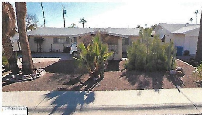
FRUITLESS OLIVE – 957 E Lilac Dr