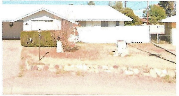
ELM – 1138 E Bluebell Ln