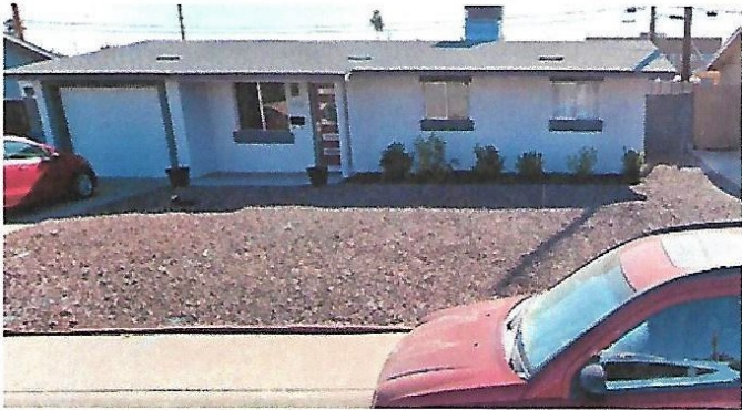
MESQUITE - 1155 E Marigold Ln