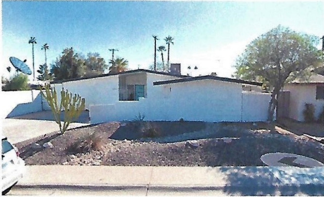
TIPU – 1033 E Bluebell Ln