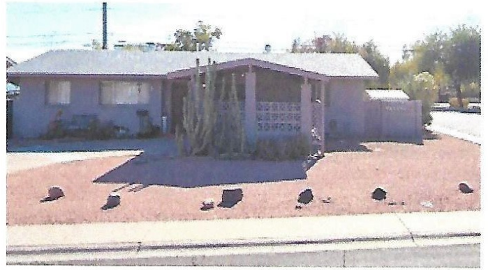
ELM - 1101 E Marigold Ln