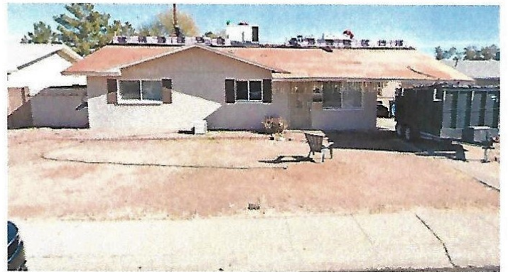
MESQUITE – 1715 N Daffodil St