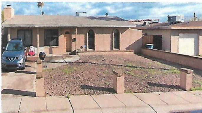
ELM - 116 E Marny Rd