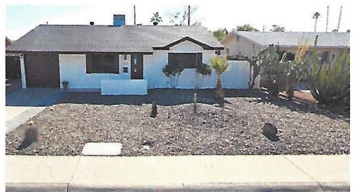
MESQUITE – 1001 E Lilac Dr.