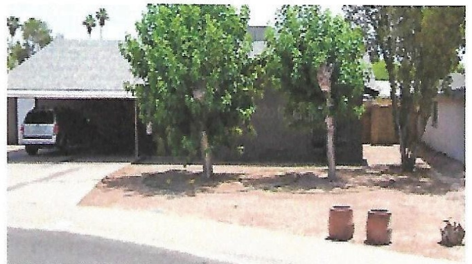
TIPU - 1411 N Rose St.