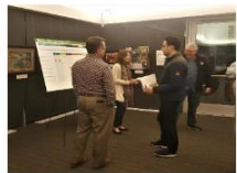
4 Parks & Recreation Master Plan Process