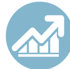
Financial Stability & Vitality

3.16 Achieve ratings of "Very Satisfied" or "Satisfied" with the "Quality of City parks, recreation, arts, and cultural centers" greater than or equal to the top 10% of the national benchmark cities as measured in the Community Survey.