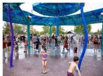
2 Recognition & Table of Contents