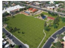
9 Implementation & Finance