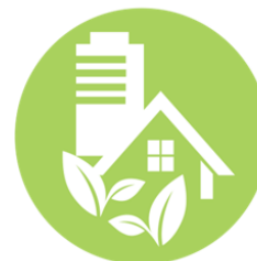
Sustainable Growth & Development