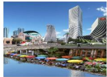
7 A Parks & Recreation System for Our Future