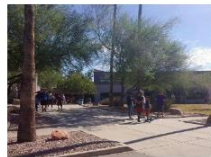
6 Our Parks and Recreation System Today (2020)