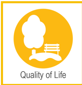
Quality of Life