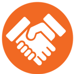
Strong Community Connections