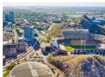
5 About Our City