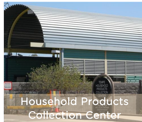
Household Products Collection Center