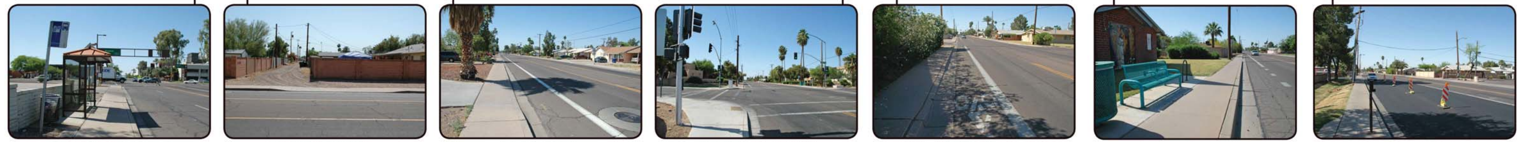
Broadway Bus Stop