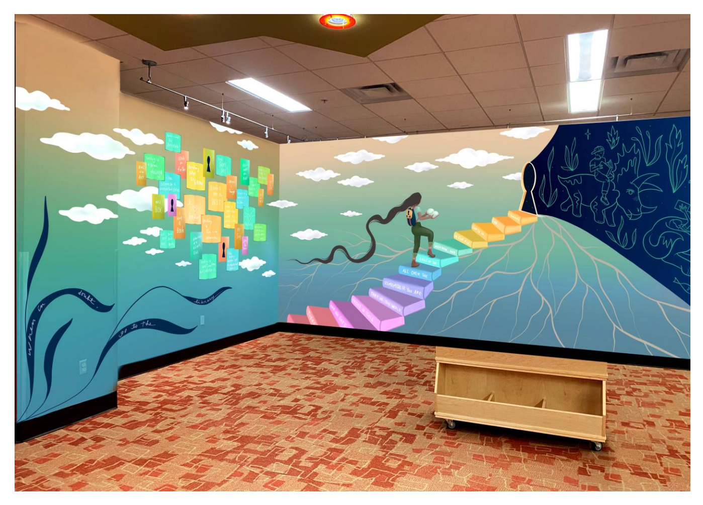
Render view of artist Shela Yu's proposal for the Tempe Youth Library. The books shown will be hand painted actual books created by tween and teen library patrons through a workshop with the artist.

Yu's concept includes a mural as well as a sculptural element made of hand painted books. These books will be created through a workshop with tweens and teens (the users of the space) in late spring or early summer. The workshop may be either virtual in person to be determined as Covid metrics are assessed.