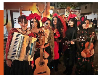
Las Chollas Peligrosas - April