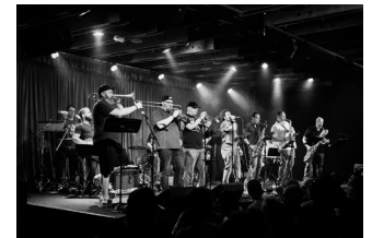
8 Bit Mammoth - Dec