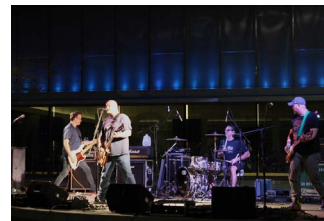
Dead Hot Workshop - Feb