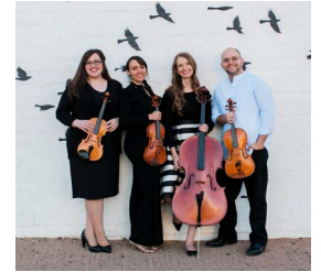
Tetra String Quartet - Oct