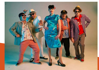
Moonlight Magic - April