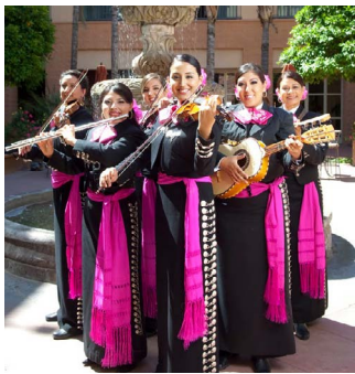
Mariachi Pasion - Jan