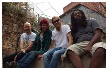
Japhy's Descent - March