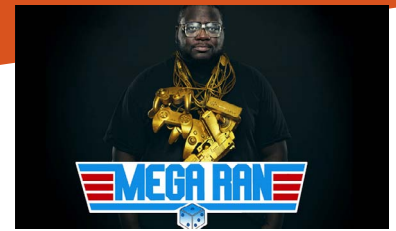
Mega Ran - Sept