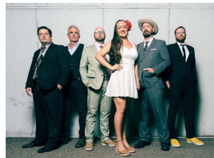
Sugar Thieves - Feb