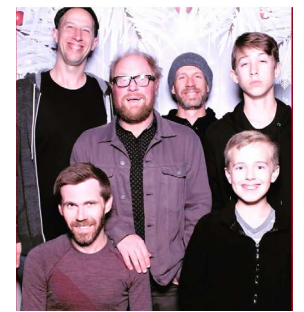
minibosses - Nov