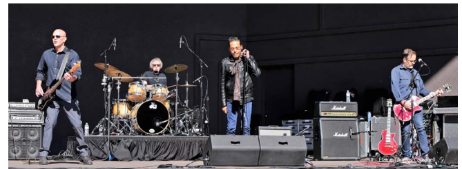
Pistoleros - Feb