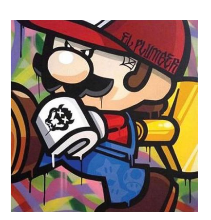
Exhibit runs through Sunday, November 29

Visit the exhibit to learn about favorite local arcades, see vintage game systems, play classic arcade machines and discover what is next in the world of gaming.