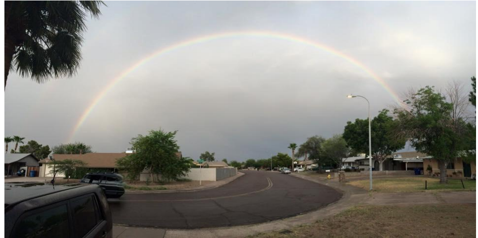
Double rainbow over the neighborhood on June 4, 2015.