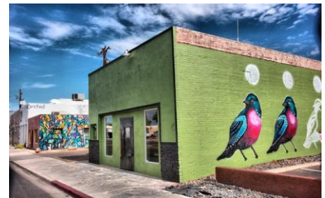
Three Birds mural