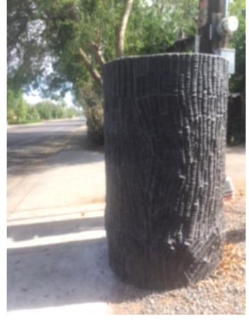
N Solomon/Maple Ash