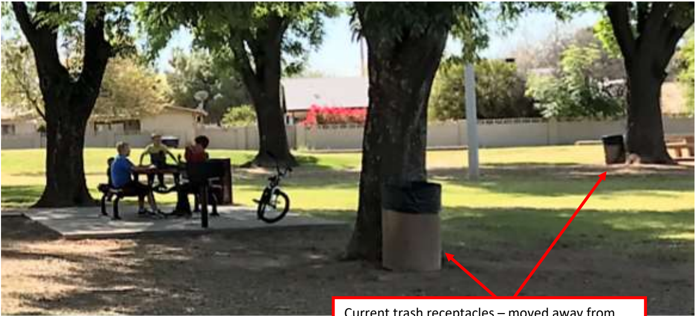
Current trash receptacles – moved away from benches