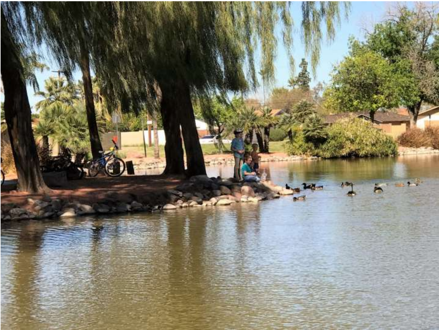
Selleh Park Wildlife and Bike Riders