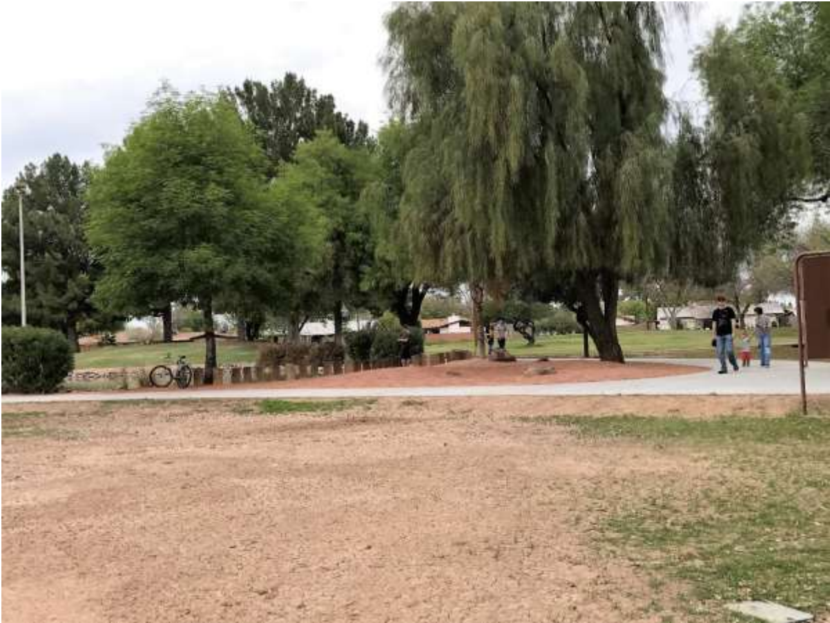
Selleh Park is an actively used park