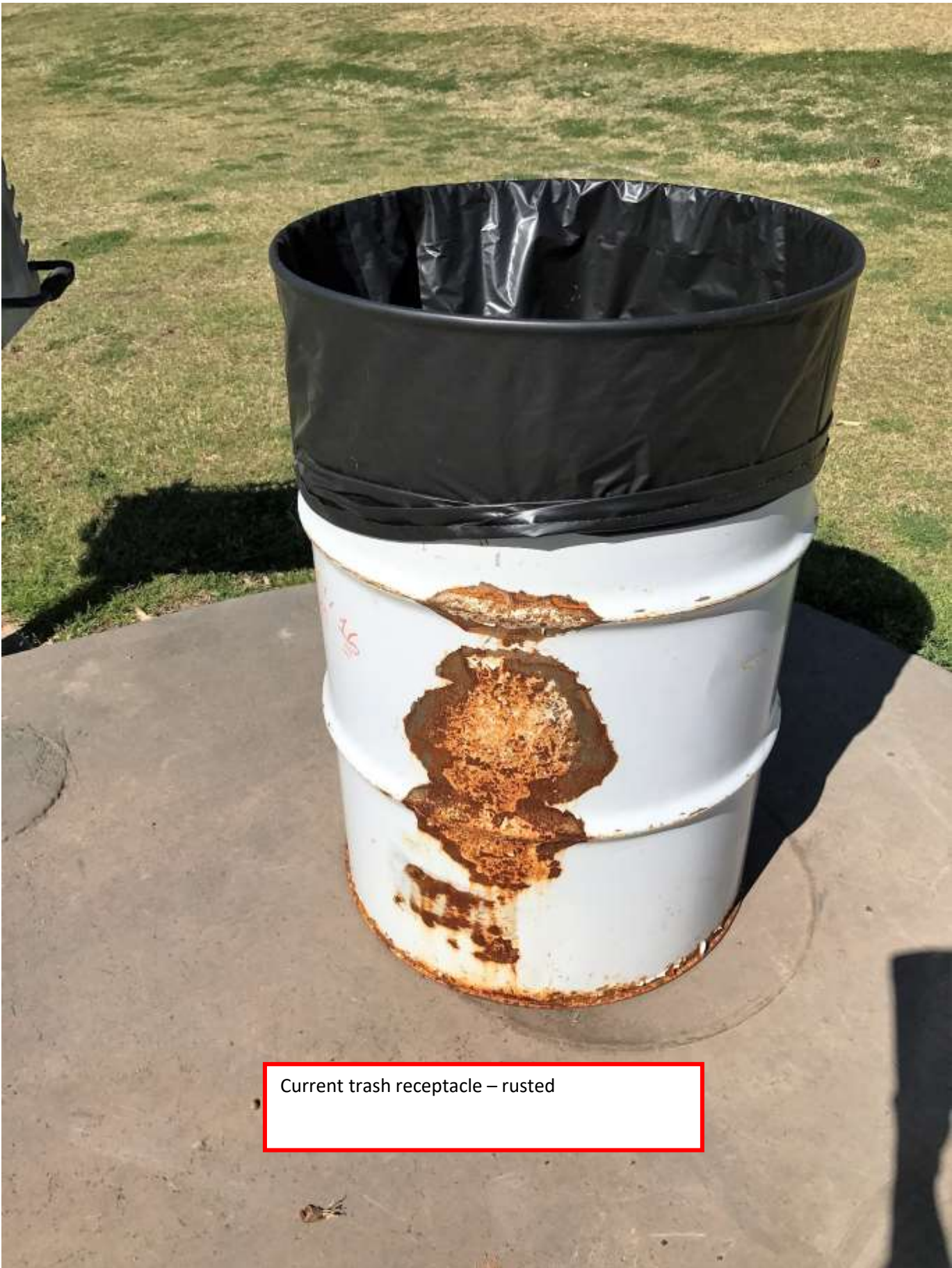
Current trash receptacle – rusted