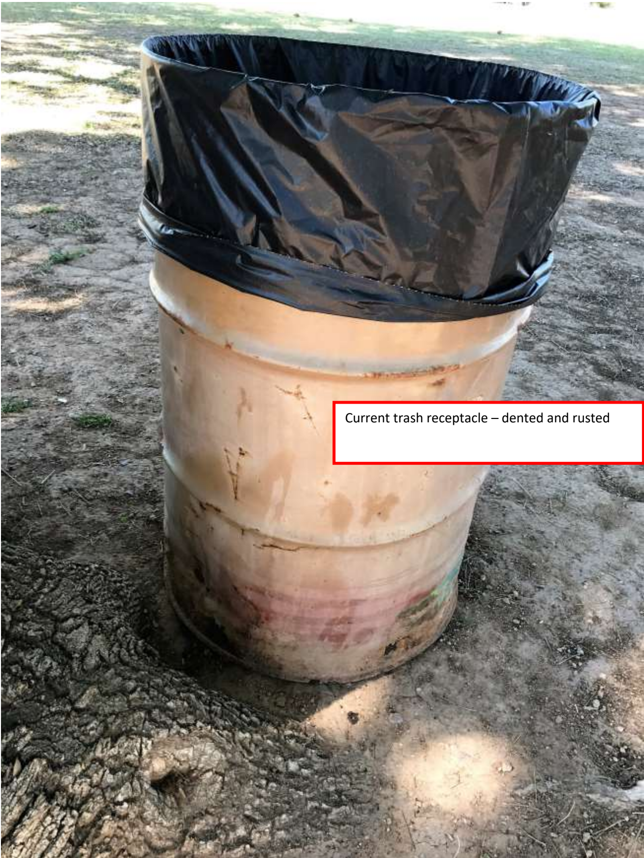
Current trash receptacle – dented and rusted