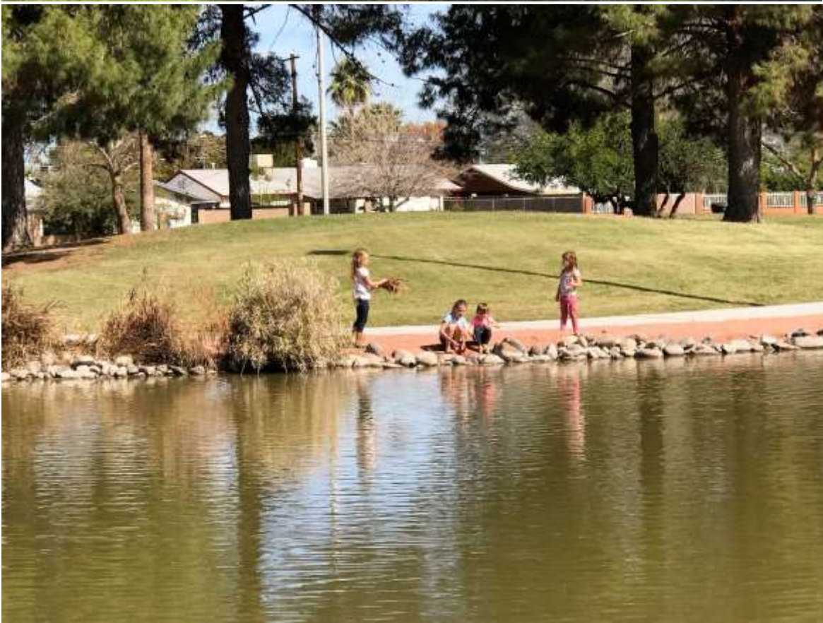
Selleh Park is an actively used park