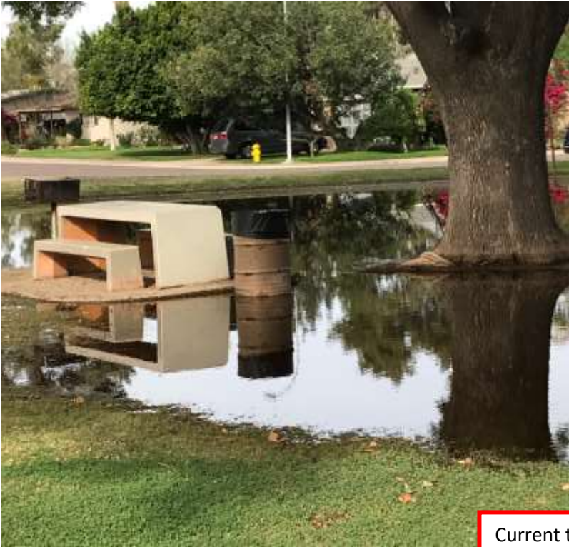
Current trash receptacles – constantly sit in standing flood irrigation water