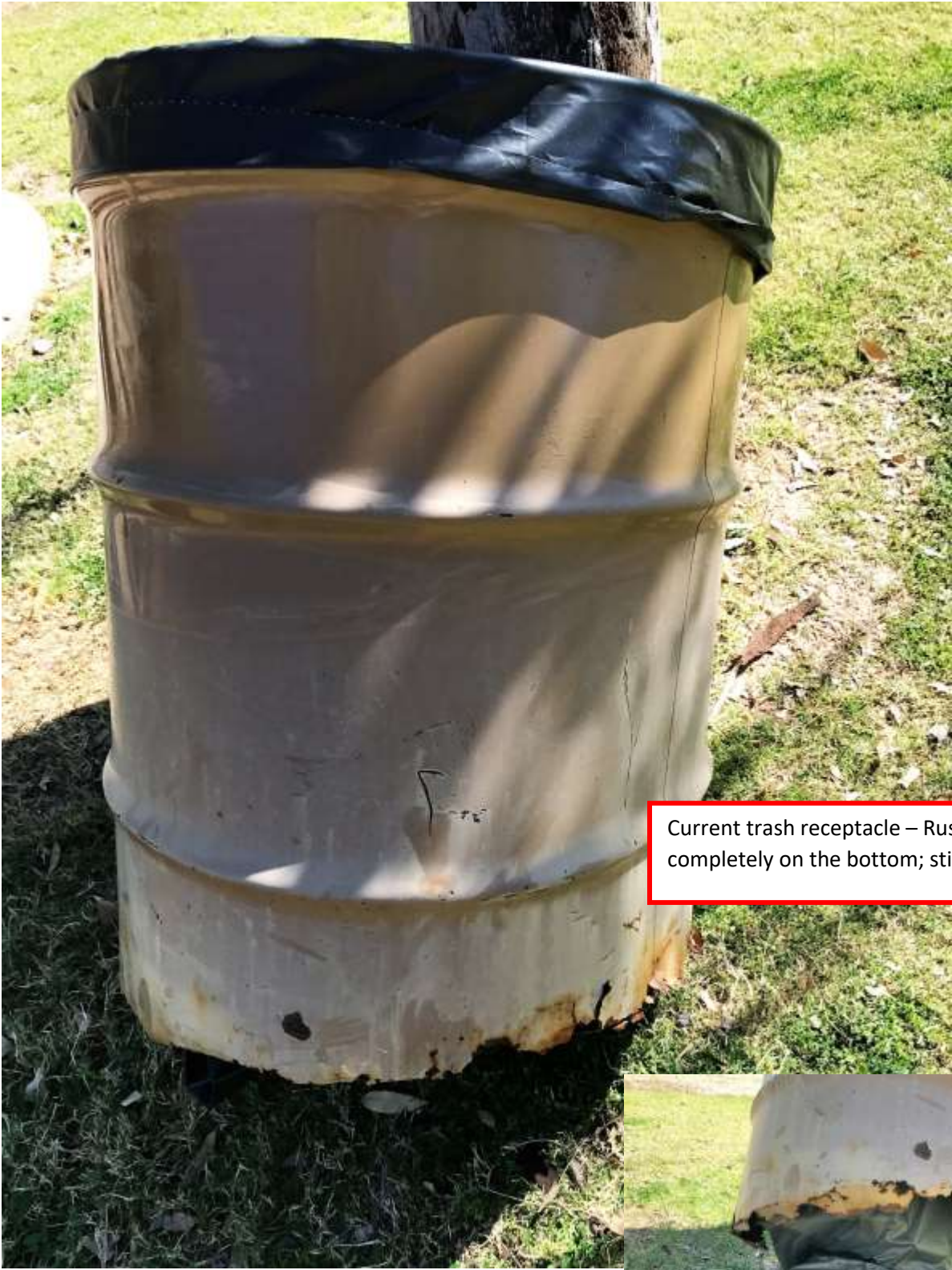
Current trash receptacle – Rusted out completely on the bottom; still being used