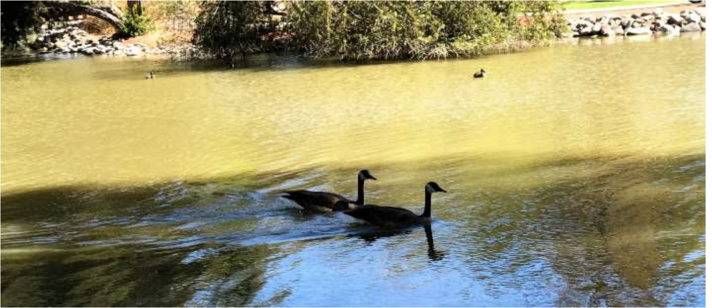
Selleh Park Wildlife