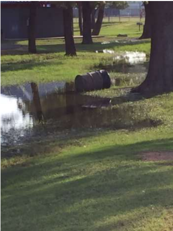
Current trash receptacles – knocked over and floating in irrigation. Different benches and/or days