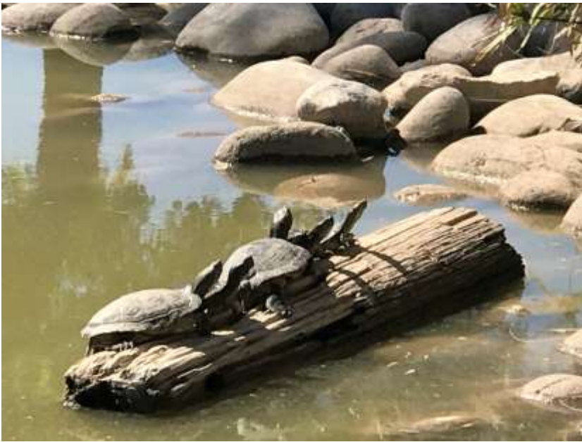
Selleh Park Wildlife