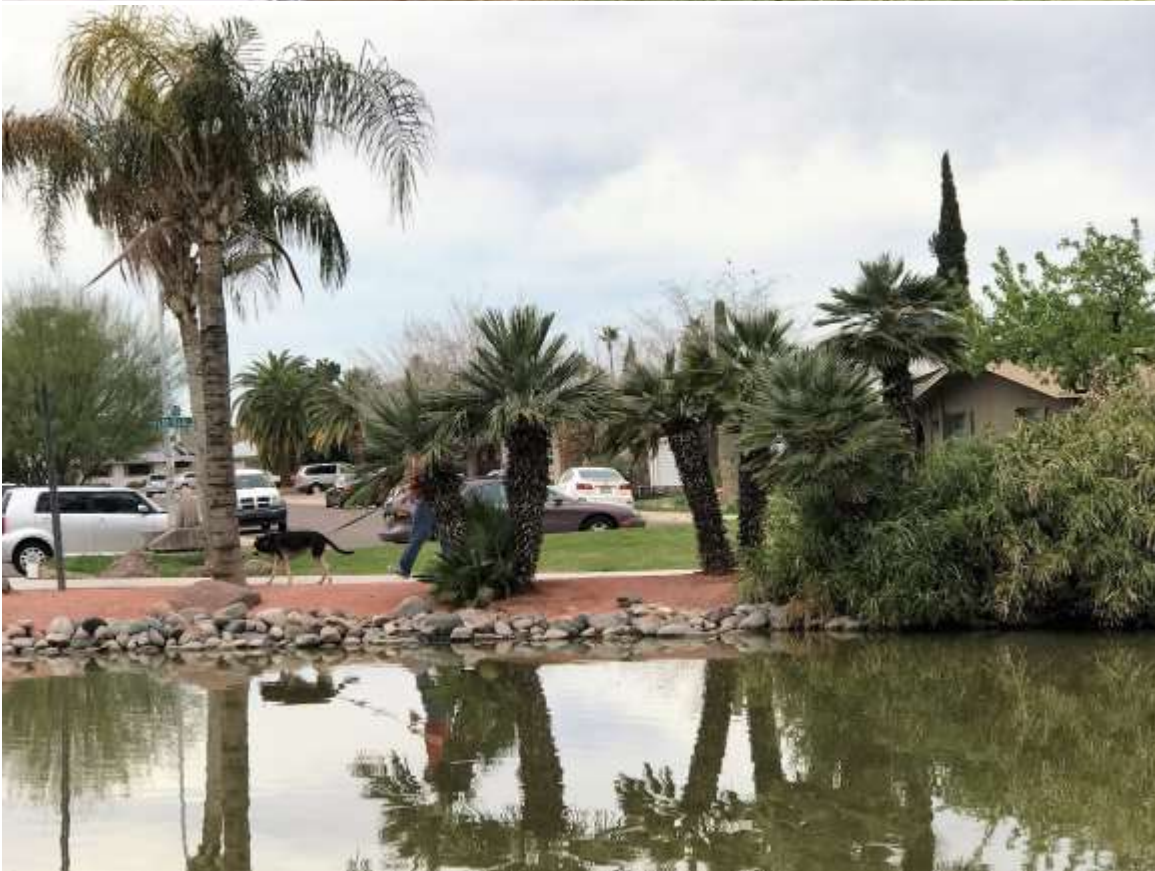
Selleh Park is an actively used park