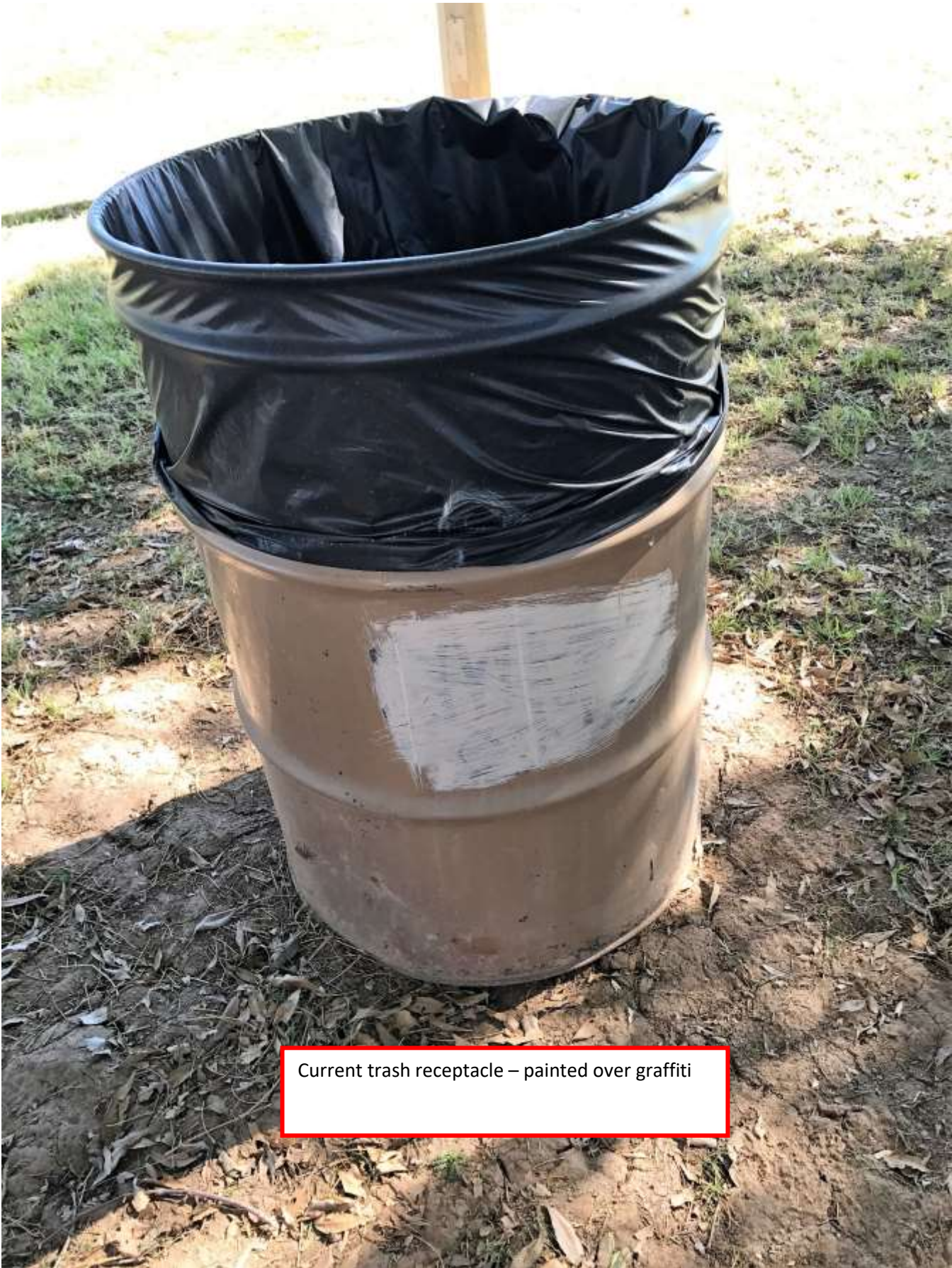
Current trash receptacle – painted over graffiti