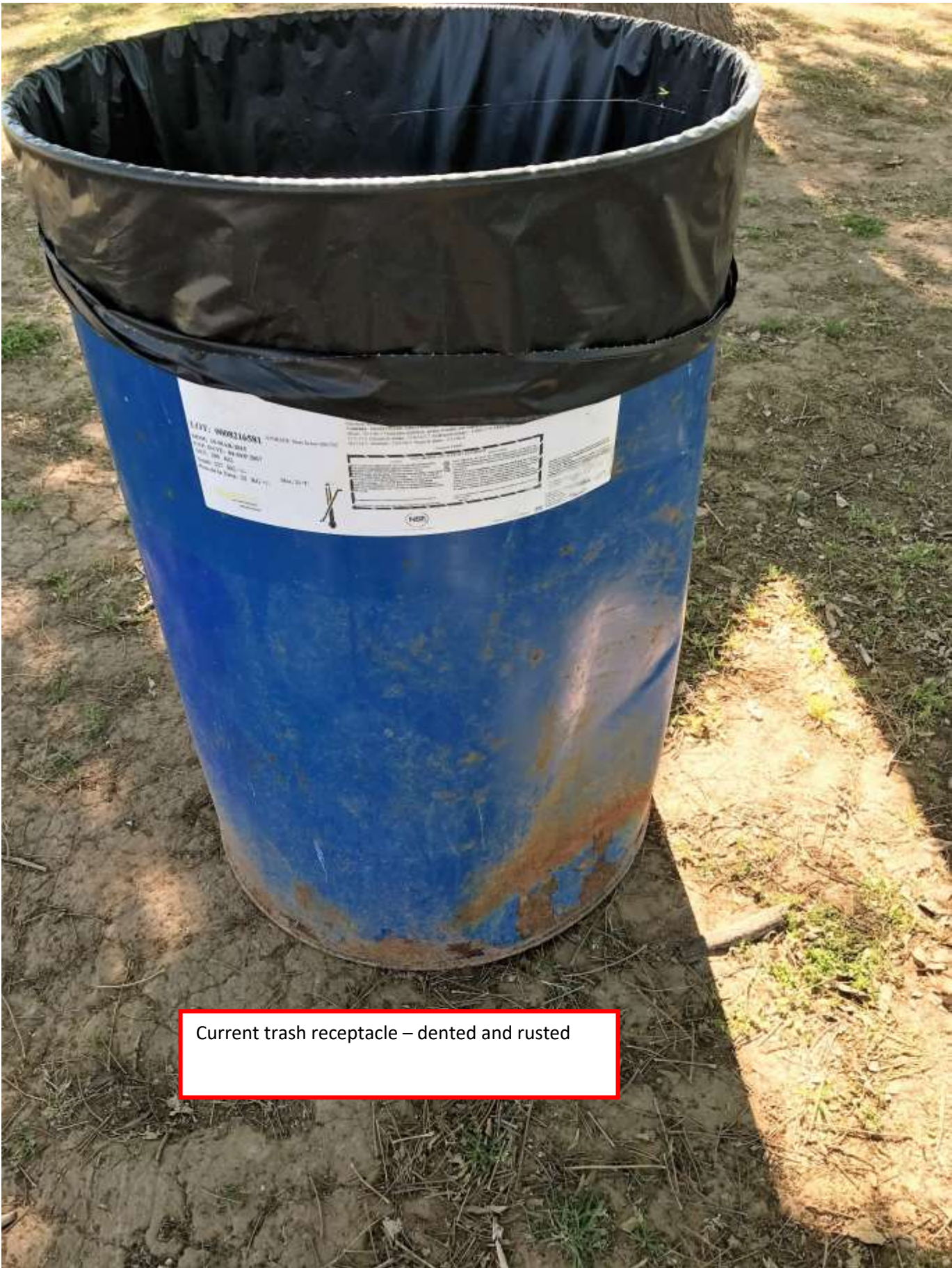
Current trash receptacle – dented and rusted