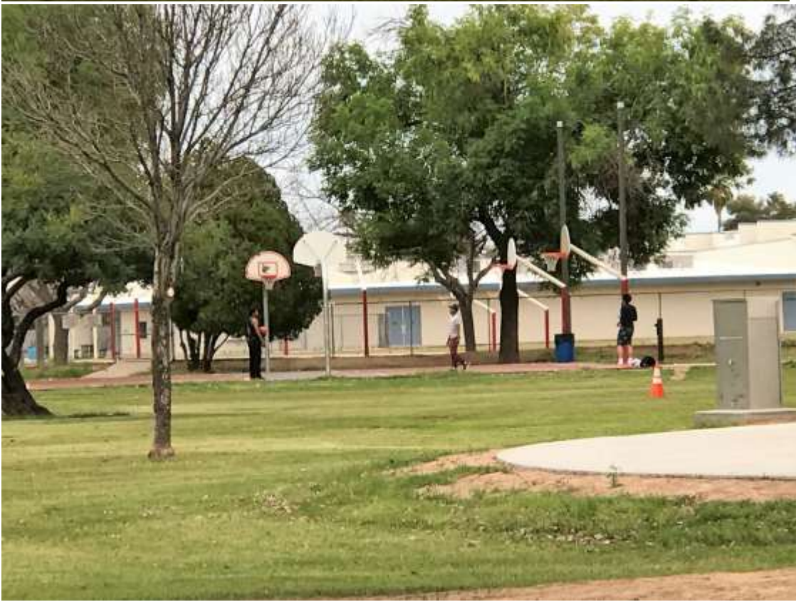
Selleh Park is an actively used park day and night