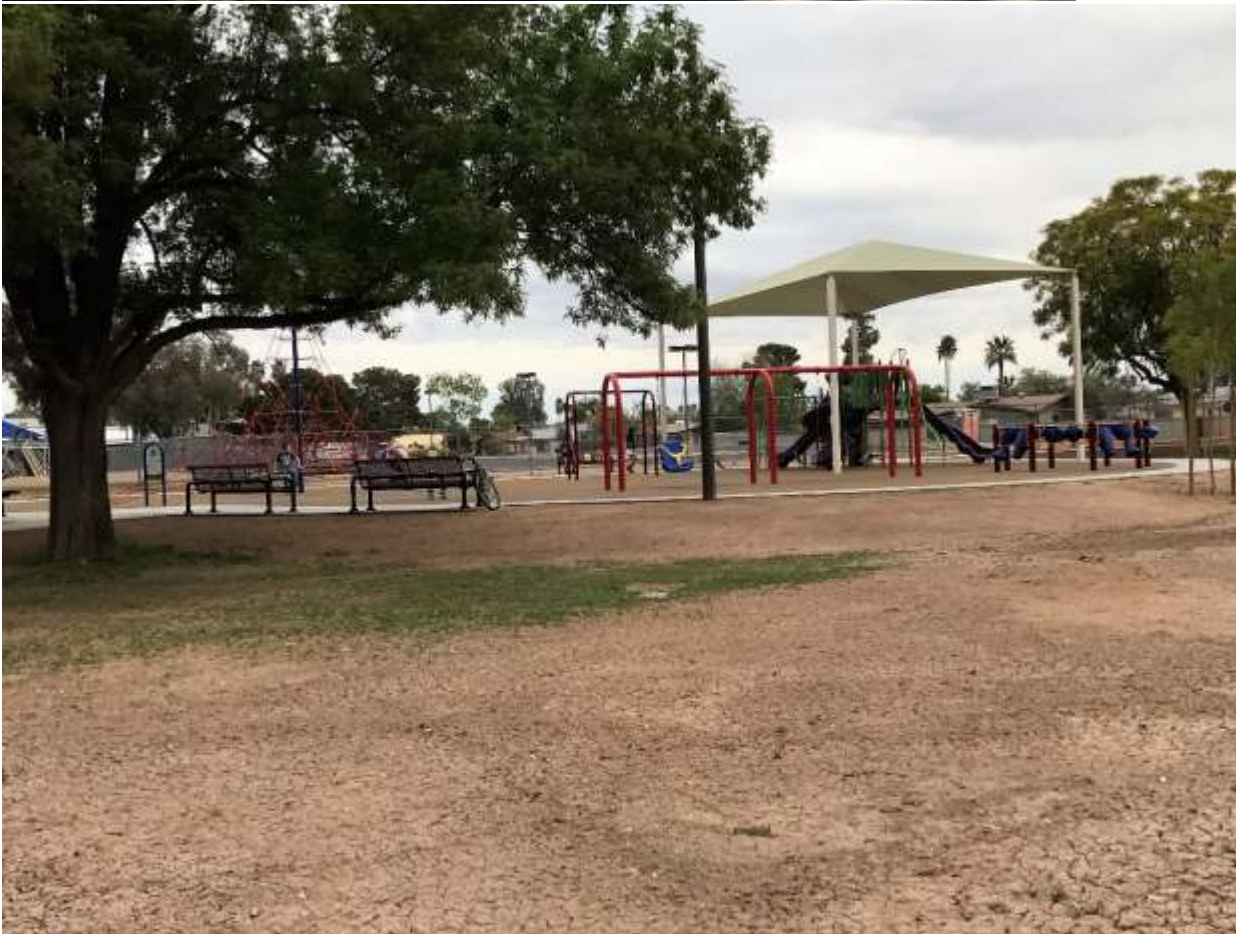
Selleh Park is an actively used park