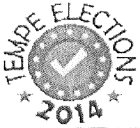
Exhibit A to City of Tempe Resolution No. R2014.150