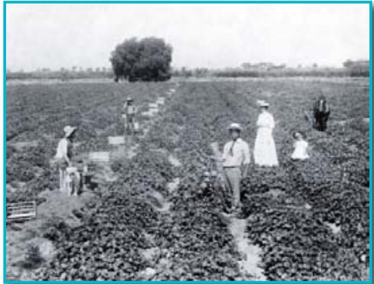
Picking canteloupes on the McClain Ranch, 1903

Measuring the Earth's surface to create boundaries for mapmaking and the layout of an area.