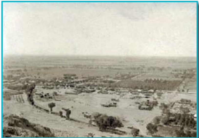
View of San Pablo looking south from the Butte

Separation or isolation from others or from a main group.