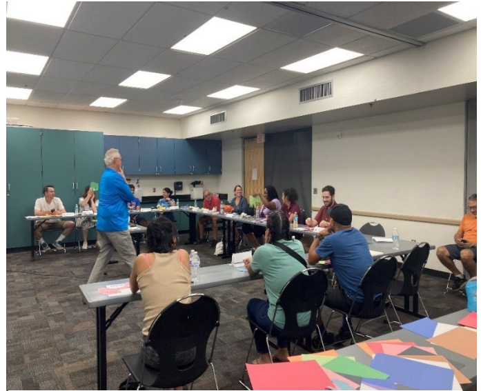
Tree Stewards in Workshop 1 sharing their construction paper trees, representing meaningful trees from their lives.

The City of Tempe launched the first cohort of the Community Tree Stewards Program, facilitated in partnership between the city's Sustainability & Resilience and Urban Forestry divisions. This program educates community members as Community Tree Stewards to help grow, plant, and maintain trees in neighborhoods with low tree canopy coverage and high levels of heat vulnerability. The program goes beyond planting trees, with a key goal of the Tree Stewards engaging in community outreach to help their neighbors understand tree health, learn planting techniques, and help with maintenance. These neighborhood greening efforts will provide cooling benefits by adding more trees to the city and empower residents to care for them, while also creating workforce development opportunities for Tree Stewards who may be considering careers in urban forestry, natural resources, and sustainability.