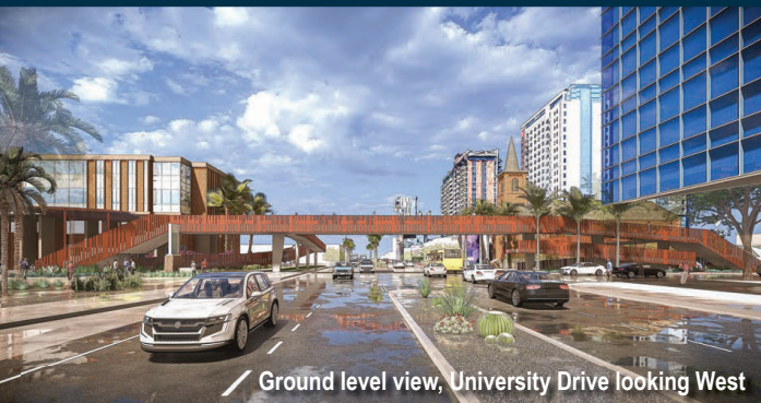
Ground level view, University Drive looking West