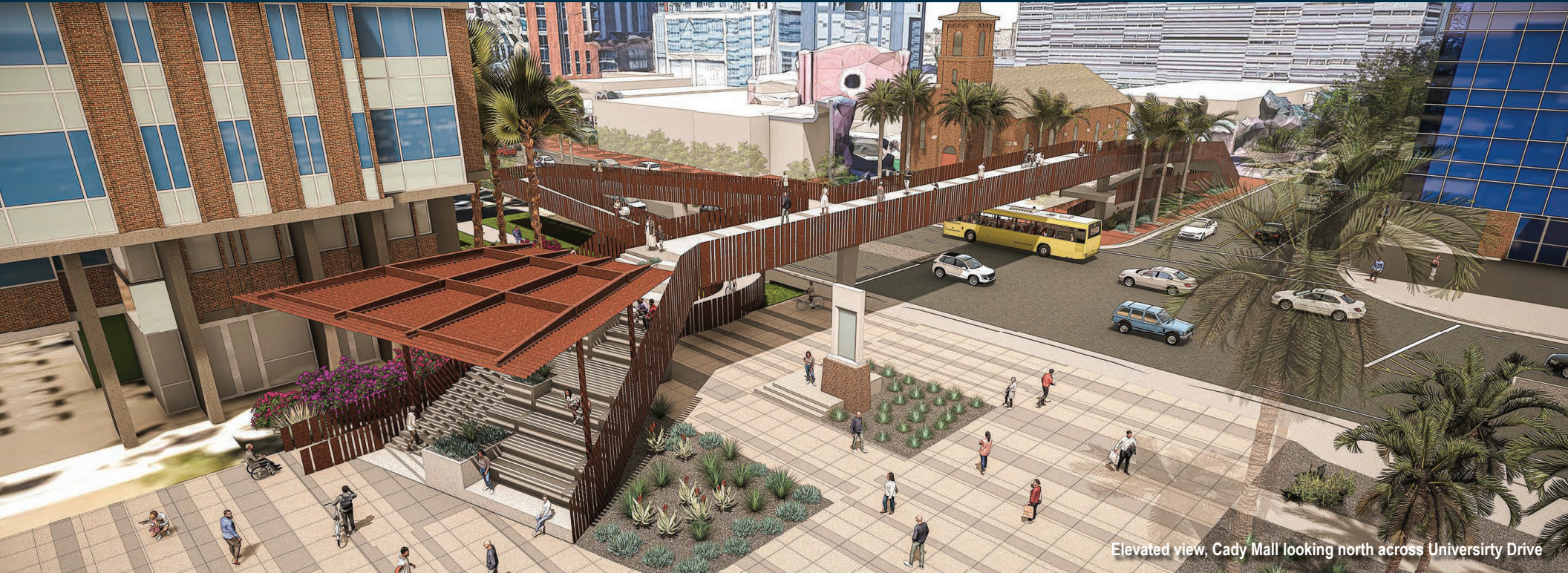
Elevated view, Cady Mall looking north across University Drive