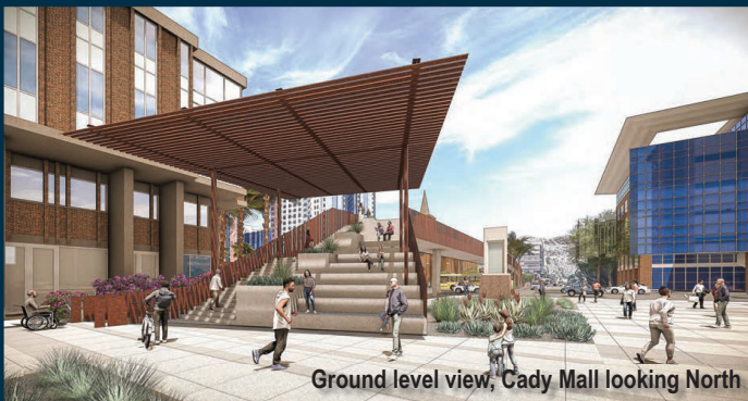
Ground level view, Cady Mall looking North