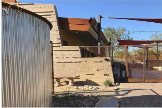
board form concrete