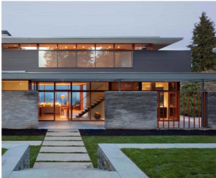
angled white metal fascia