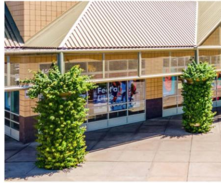
perforated columns with landscaping