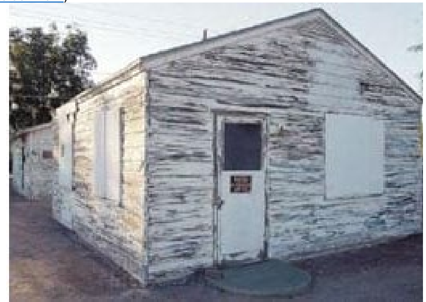
One of the POW barracks saved from demolition by the Tempe Historic Preservation Foundation

Criterion 2, Example #3: In 2005, the Tempe Historic Preservation Foundation raised money to save from demolition two barracks used to house Germans officers and enlisted men imprisoned at Camp Papago Park. These barracks are currently located on land owned by the City of Tempe. ( Source: Joe Kullman, "Tempe Group Saves Papago POW Barracks, East Valley Tribune, October 6, 2005, updated October 7, 2005, https://www.eastvalleytribune.com/news/tempe-group-saves-papago-pow-barracks/article_b60ebb09-d894-5440-a560-d89c6a3bfaa4.html )