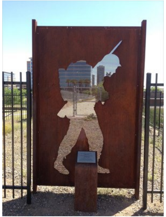
Tempe Veterans Memorial panel and marker honoring Adolph Weeks

Criterion 2, Example #7: The first panel of a forthcoming Veterans Memorial near Tempe Beach Park features a marker dedicated to the memory of World War II veteran Adolph Weeks, an Army corporal who was awarded the Bronze Star.