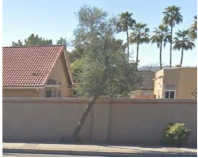
The top two photos are the olive trees scheduled for removal

A new tree palette has been identified and will include the Texas Mountain Laurel and Palo Blanco pictured below.