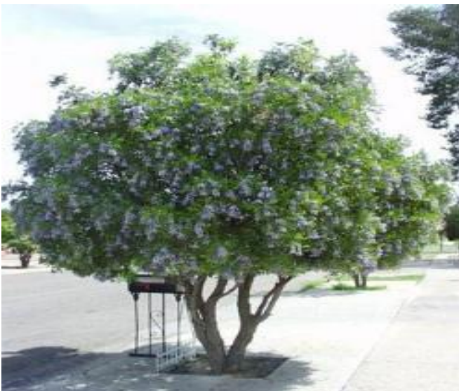
Mountain Texas Laurel

A new tree palette has been identified and will include the Texas Mountain Laurel and Palo Blanco pictured below.