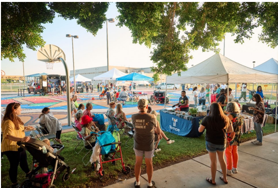
Making Space Fest participants gather to learn tips and techniques for cooking with indigenous foods from community partner Sana Sana

Participants were offered bike tune-ups from Bike Saviours, arts, crafts, and a live concert from One Way Sky thanks to our Community Arts team, a mobile work-out with the veteran-run Travis Manion Foundation, accessible and adaptive information from 2gether We Live AZ, local and indigenous cooking demonstrations and food tastings from Sana Sana, tree and plant information and giveaways from our Urban Forest team and the Arizona Sustainability Alliance, snacks and imagining with our Neighborhood Services Team, and free rides from Cycling Without Age. The event attracted participants across a wide range of backgrounds, abilities, ages, and interests and was fun for all!