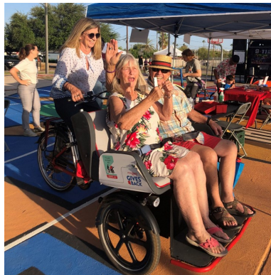
Cycling Without Age gives free rides for aging adults