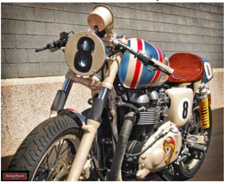
This fine piece of Brit iron is a Triumph Thruxton overhauled by the Arizona custom shop.