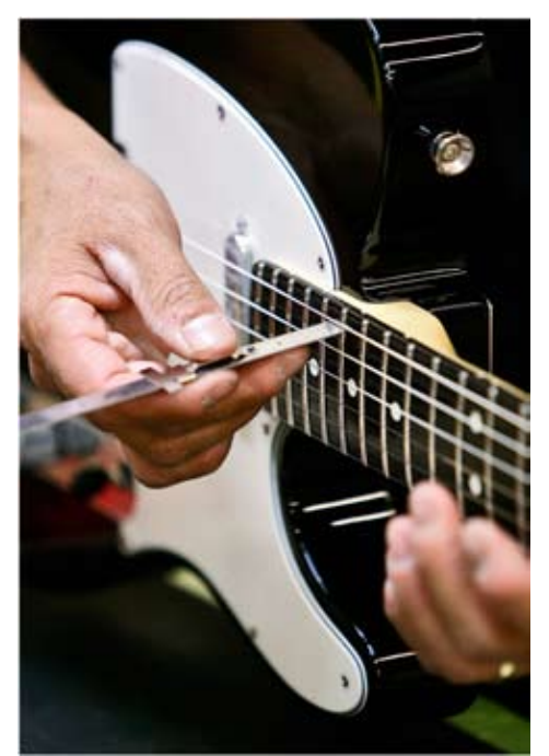
Individual attention is given to every guitar in the Fender factory.

In 1954, Fender released what would become the most popular, recognizable and influential electric guitar of all time—the Stratocaster. The soon-to-be-famous instrument featured a comfortably contoured body, three pickups (allowing a multitude of tones never heard before) and a tremolo system that allowed players to mimic popular lap- and pedal-steel tones, all while remaining in tune.