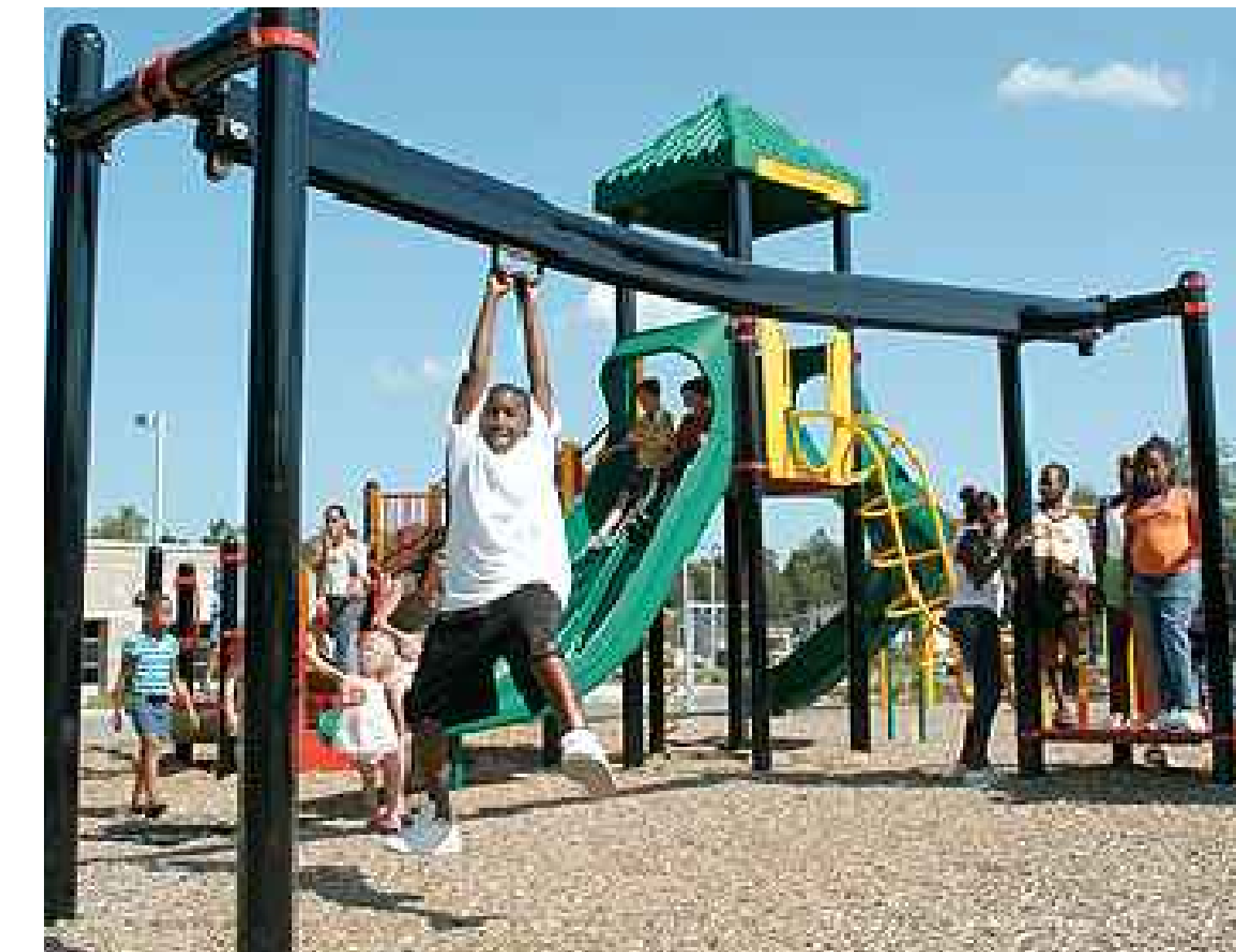
CURVED TRACK RIDE TOTAL COST = $5,400