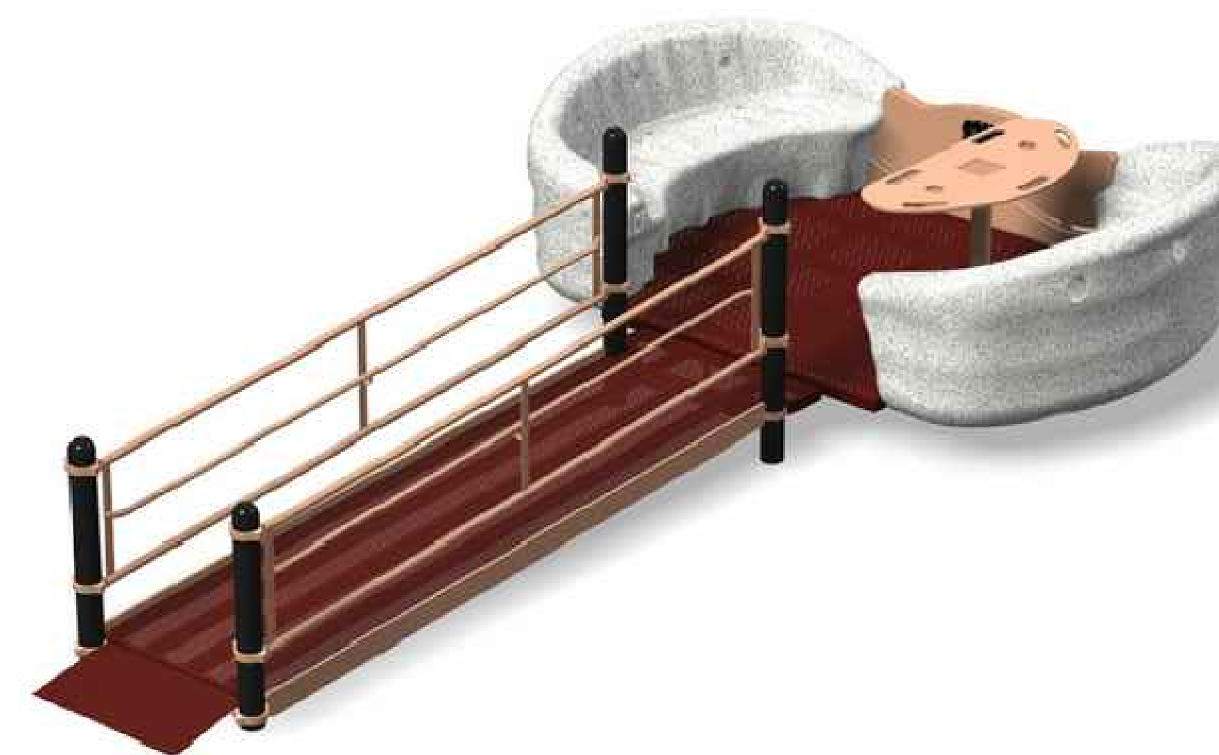
SWAY FUN GLIDER TOTAL COST = $26,000