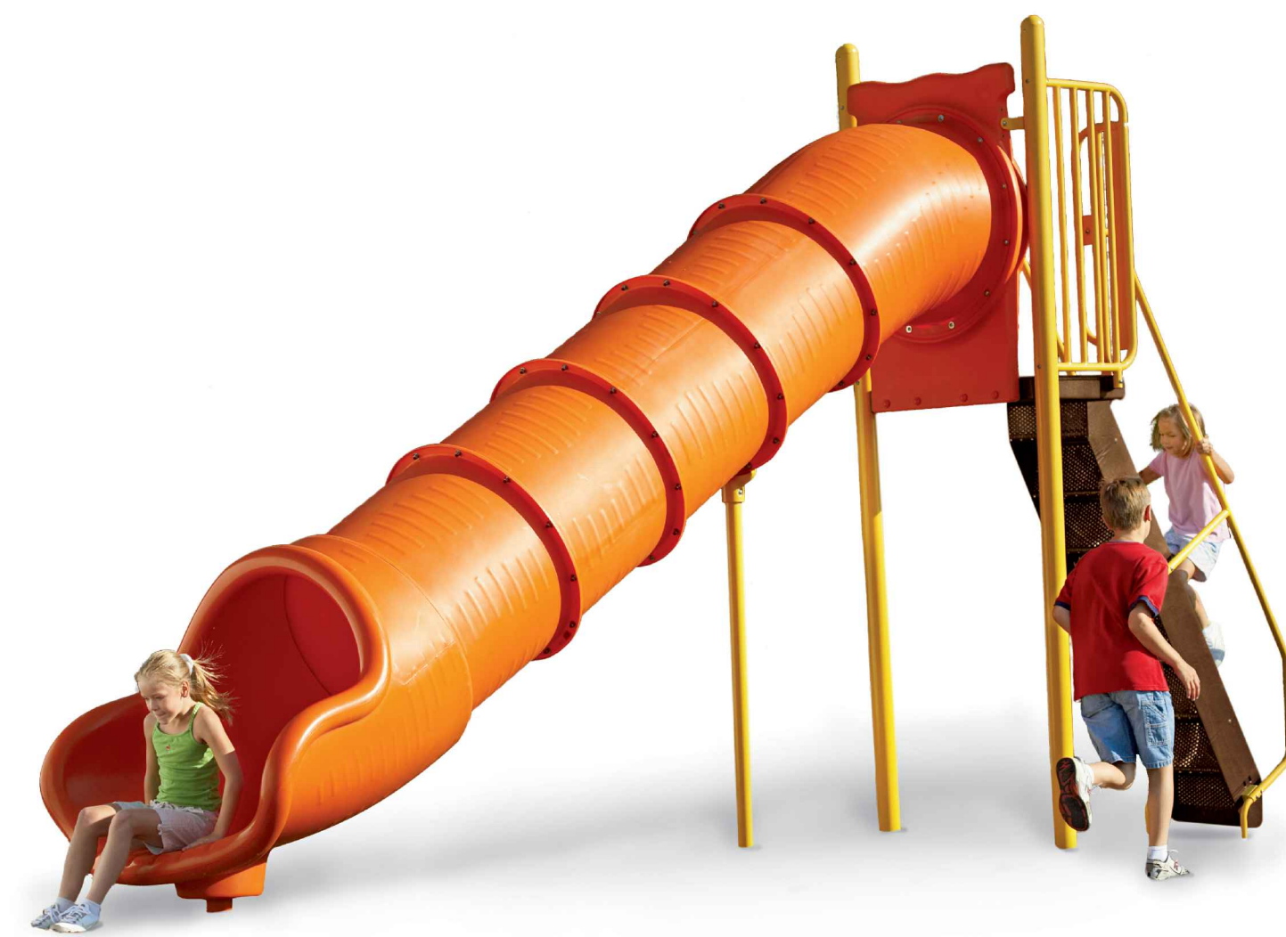
FREE STANDING SLIDE TOTAL COST = $8,900