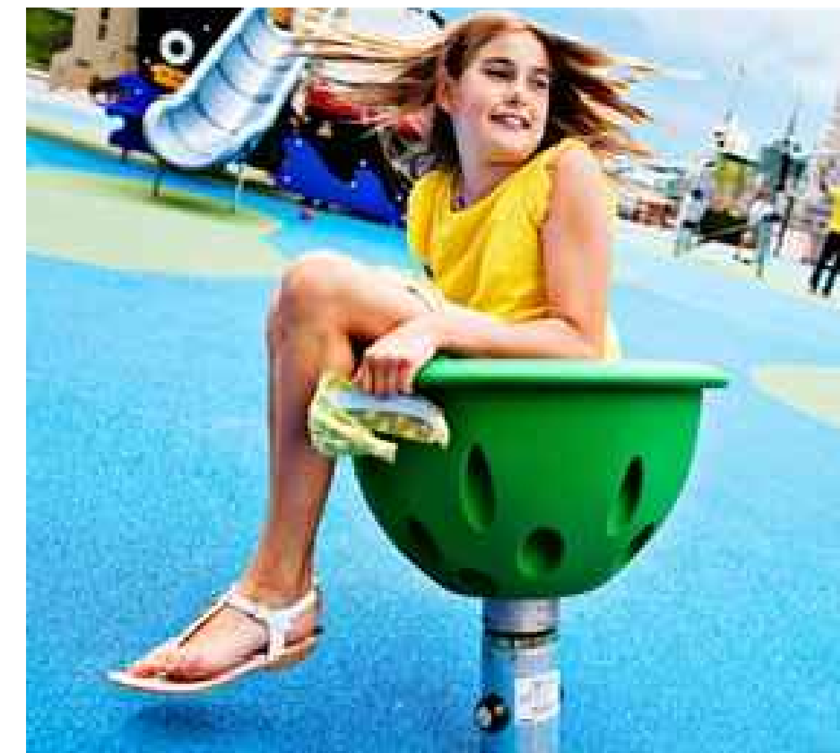
SPINNER BOWL TOTAL COST = $850 EACH