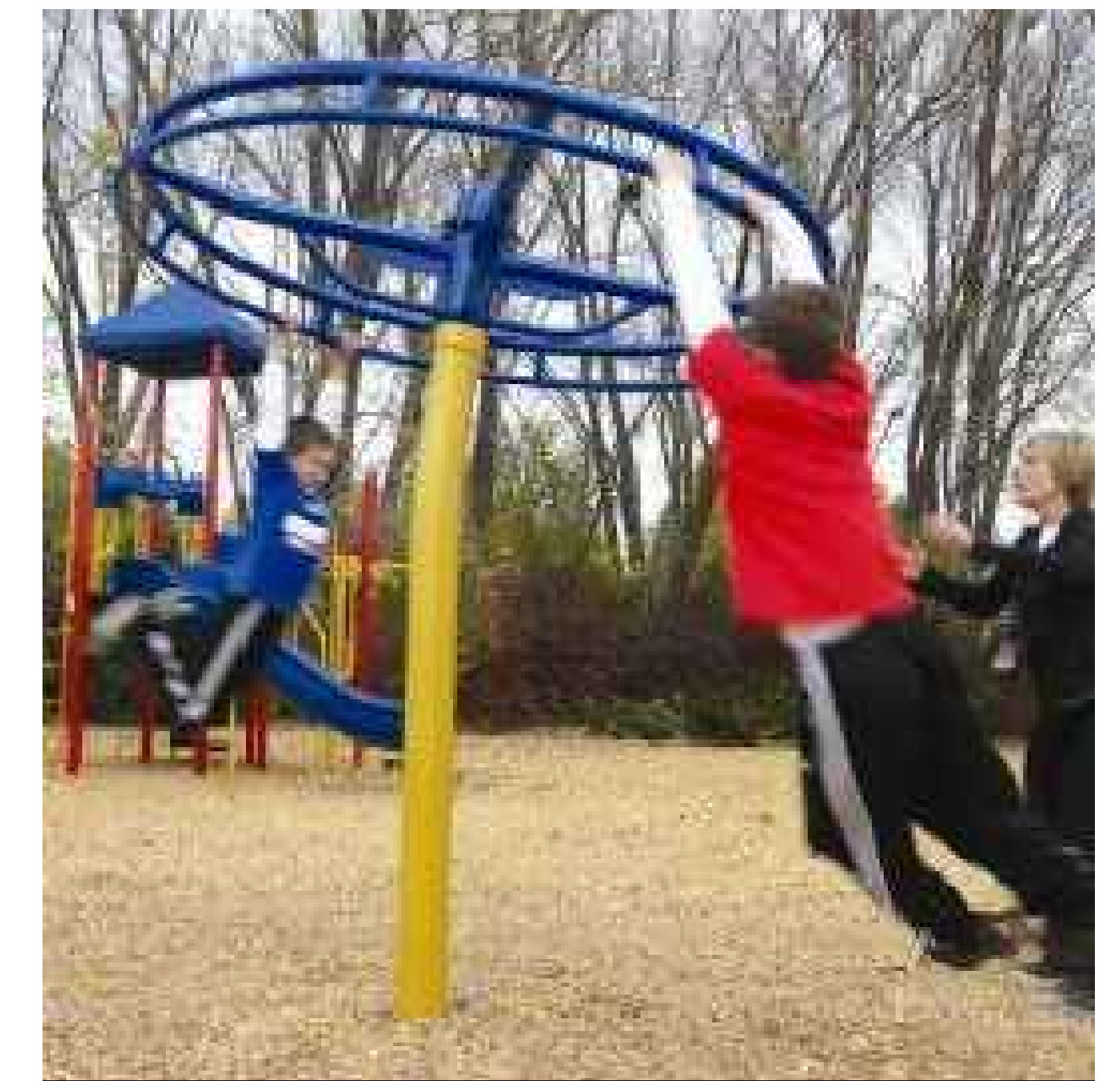
ORBITRON TOTAL COST = $3,200