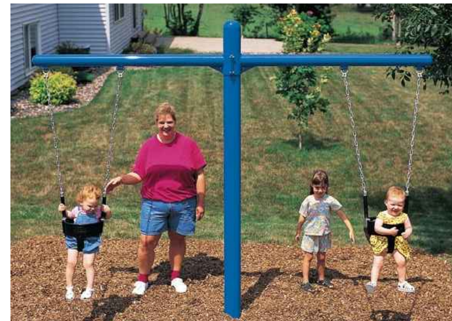
TODDLER SWING TOTAL COST = $2,200