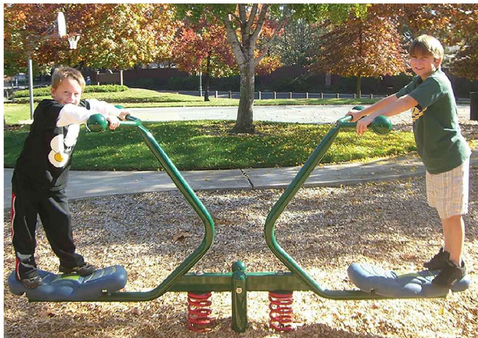
WAKE RIDER TOTAL COST = $4,200