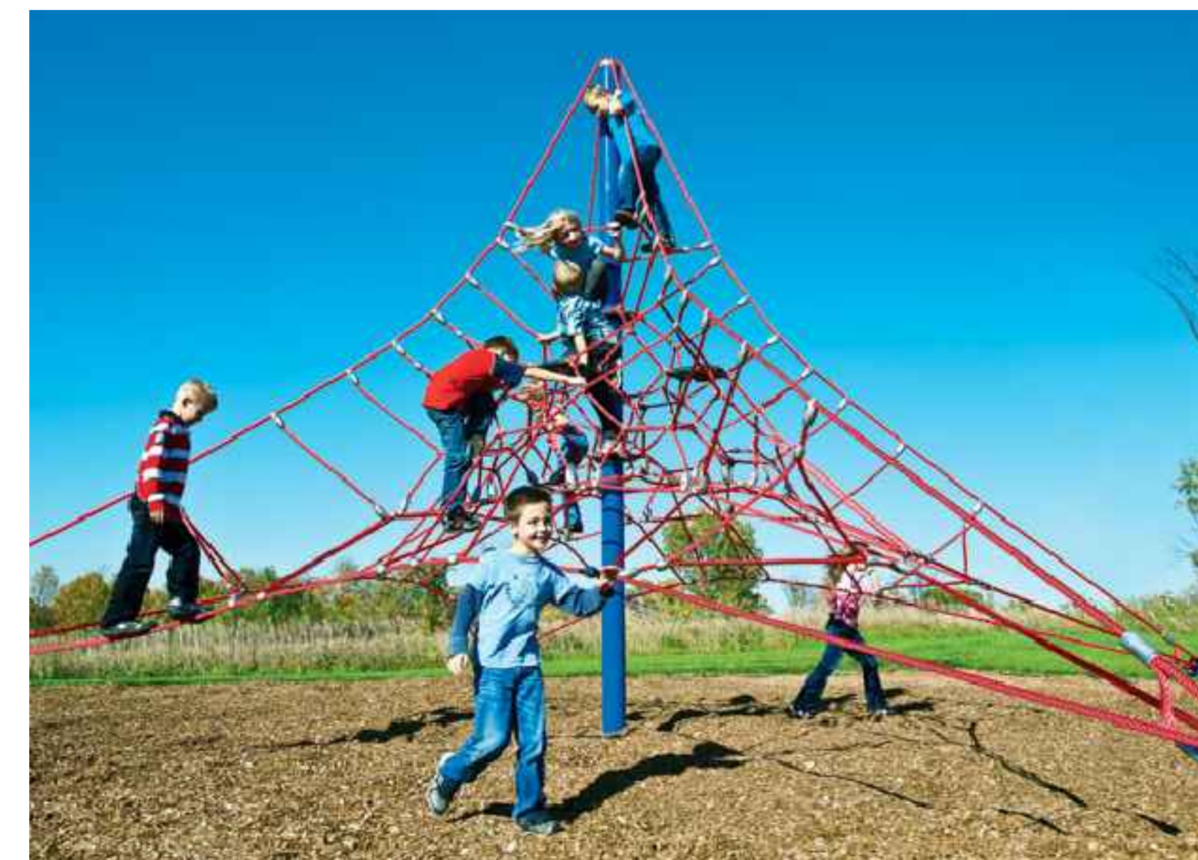
NET CLIMBER TOTAL COST = $18,300