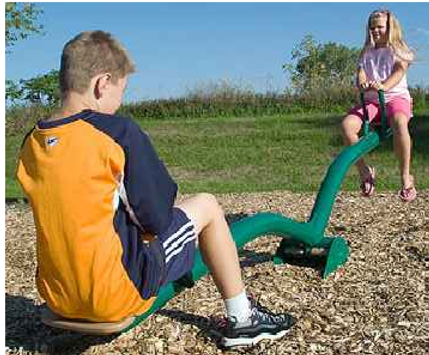
2 SEAT SEESAW TOTAL COST = $3,000