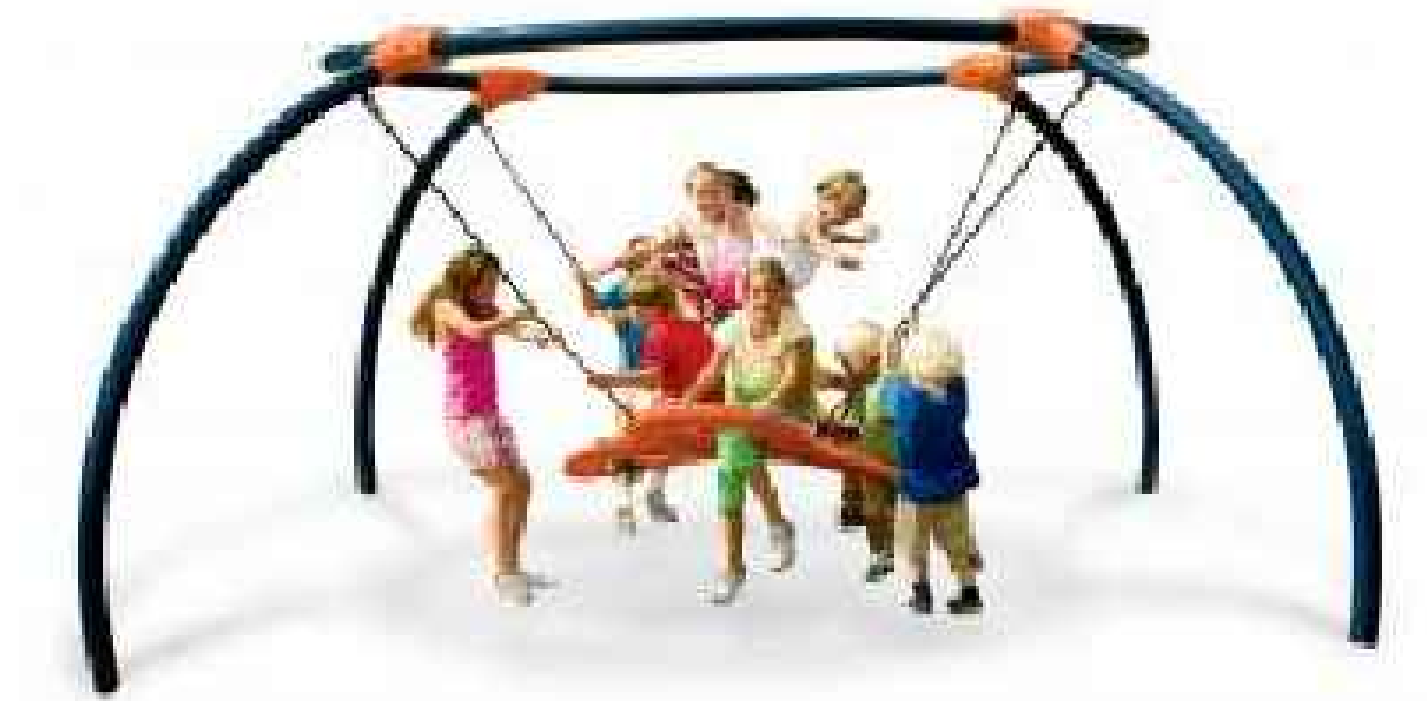
VAQUERO TOTAL COST = $5,600