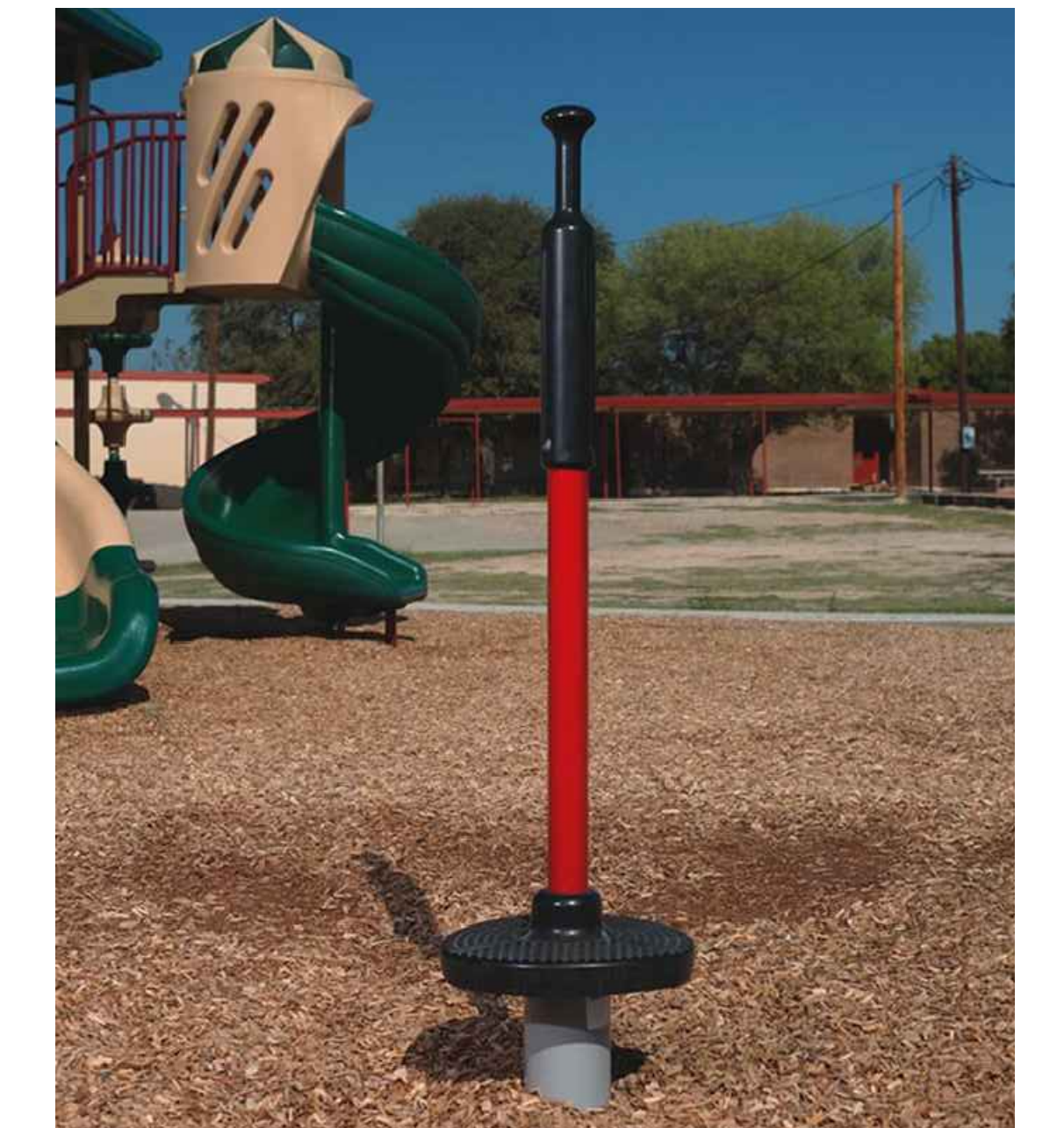
STANDING SPINNER TOTAL COST = $1,100 EACH