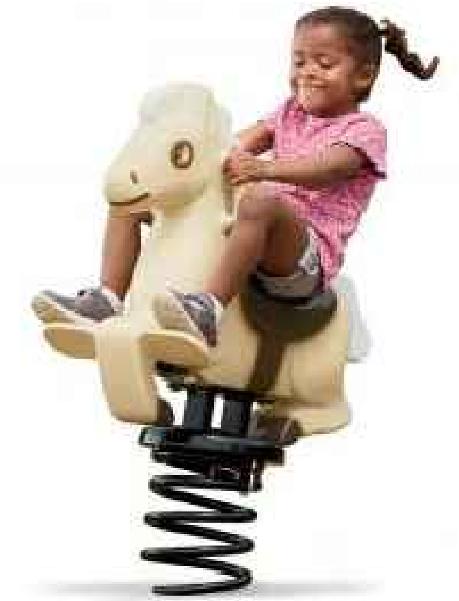
SPRING RIDER ANIMAL TOTAL COST = $950 EACH