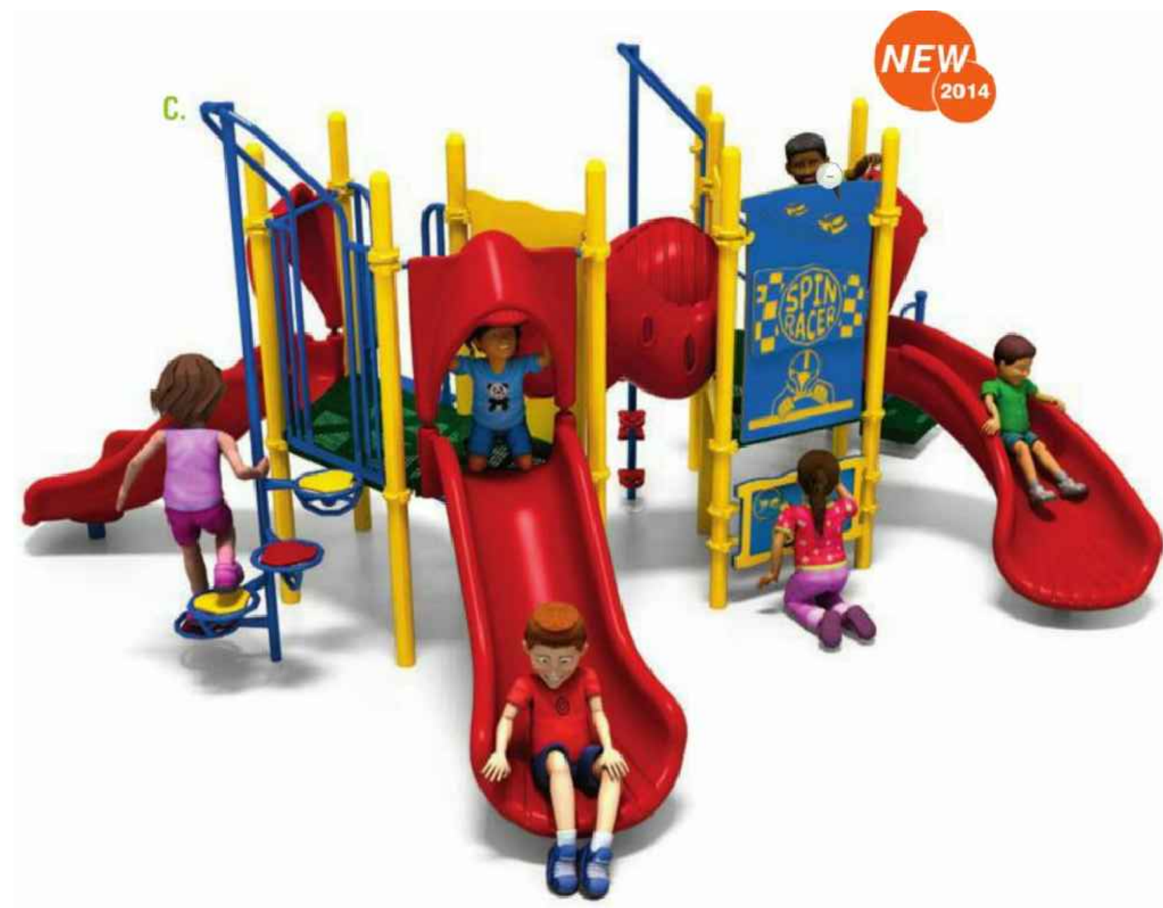
PLAY STRUCTURE SPEED CITY 350-1427 TOTAL COST = $19,400