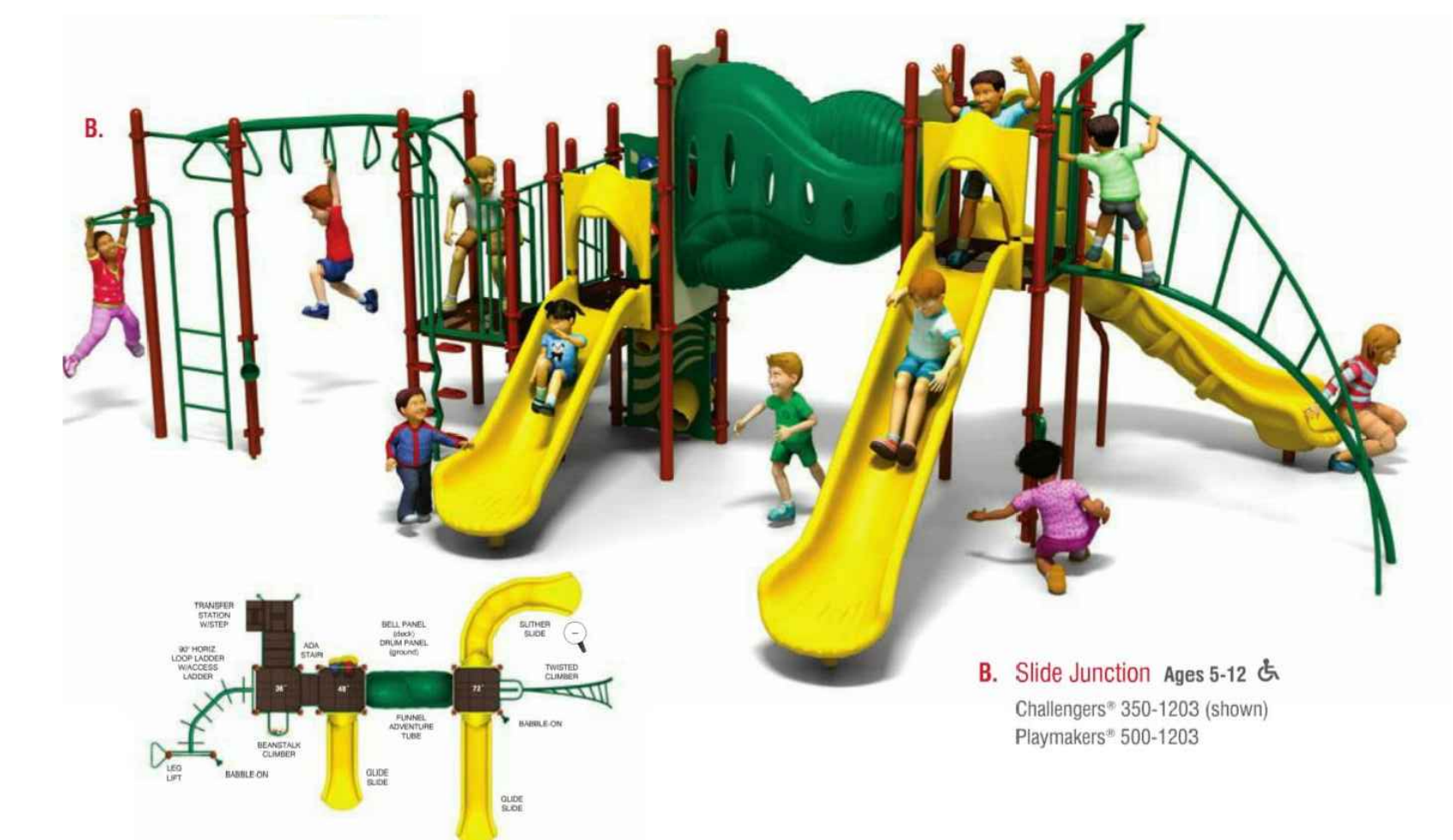
PLAY STRUCTURE SLIDE JUNCTION CHALLENGERS #350-1203 TOTAL COST = $30,200