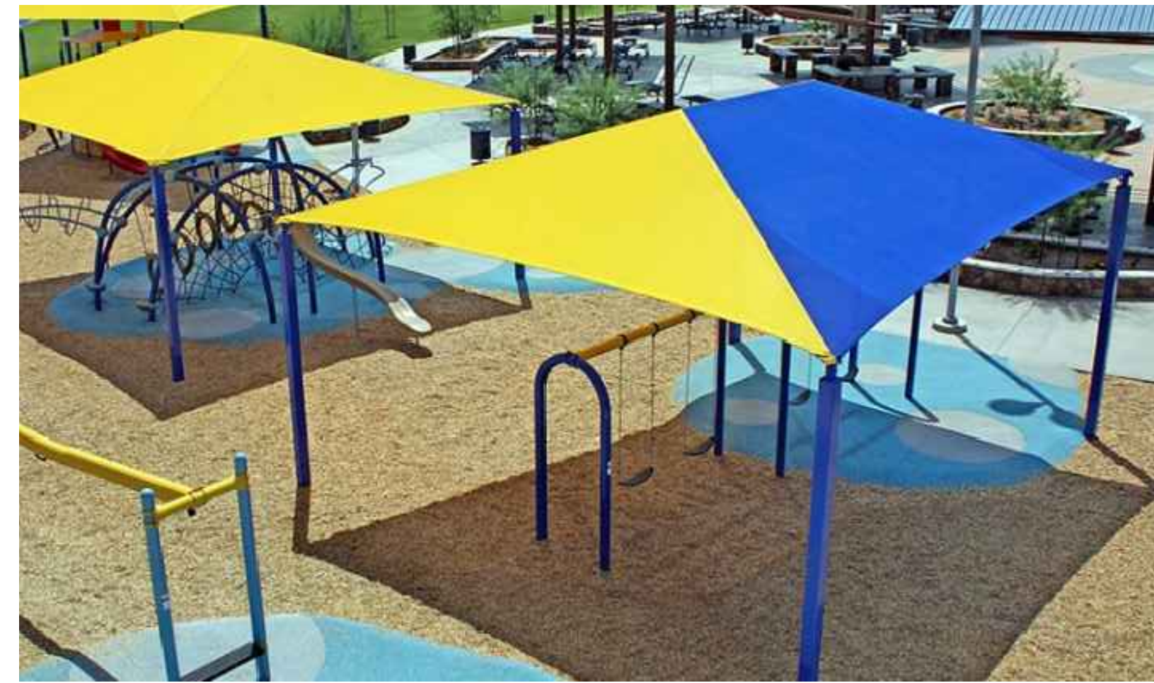
SHADE STRUCTURE 30'X40' = $20,200 EACH 20'X20' = $9,600 EACH