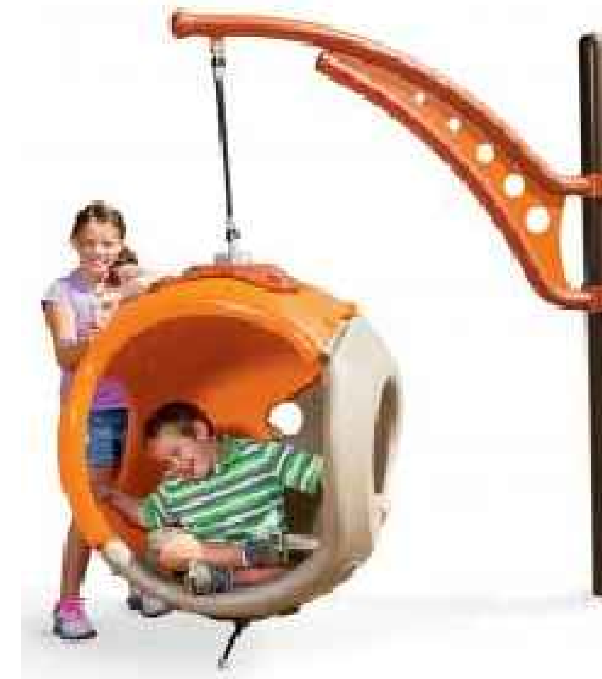
COZY COCOON TOTAL COST = $3,000