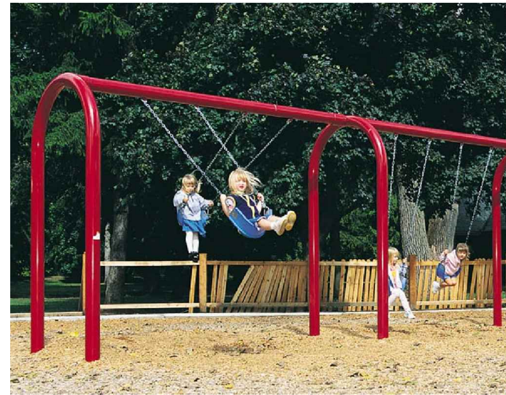
ARCH SWINGS SINGLE BAY - 2 SWINGS TOTAL COST = $3,400 ADD A BAY = $3,100