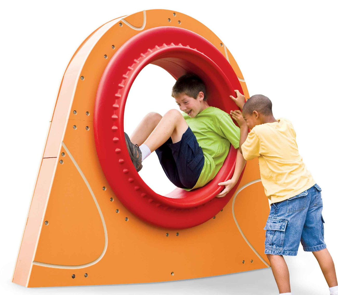
ACTIVO REVO TOTAL COST = $6,500