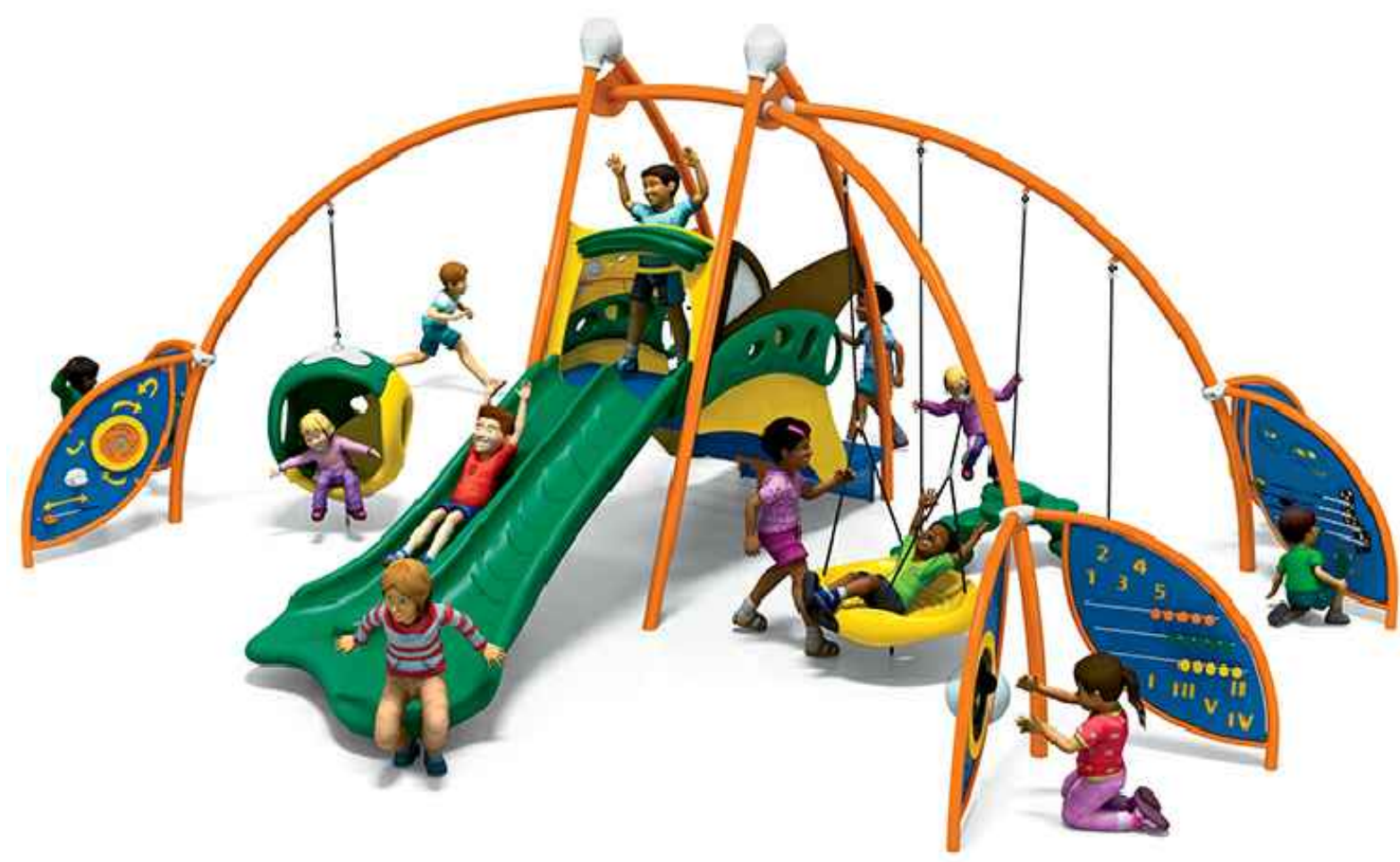
PLAY STRUCTURE FUNBURG ACT-1303 TOTAL COST = $30,800