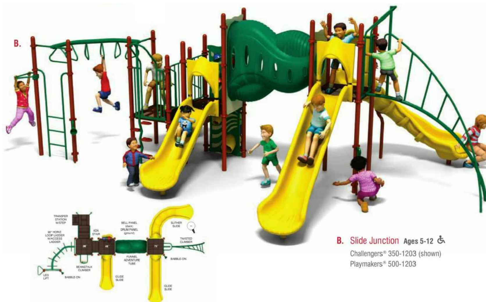
PLAY STRUCTURE SLIDE JUNCTION 500-1203 WITH 5" POSTS/ 4' DECKS AND SPIRAL SLIDE TOTAL COST = $36,400