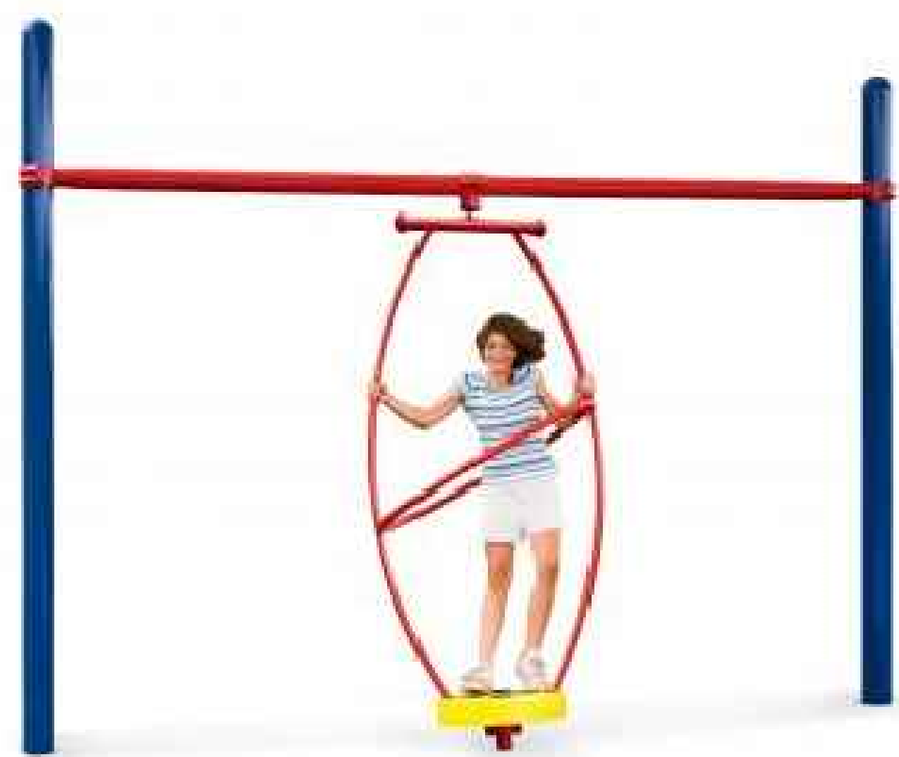
VORTEX SPINNER TOTAL COST = $3,700