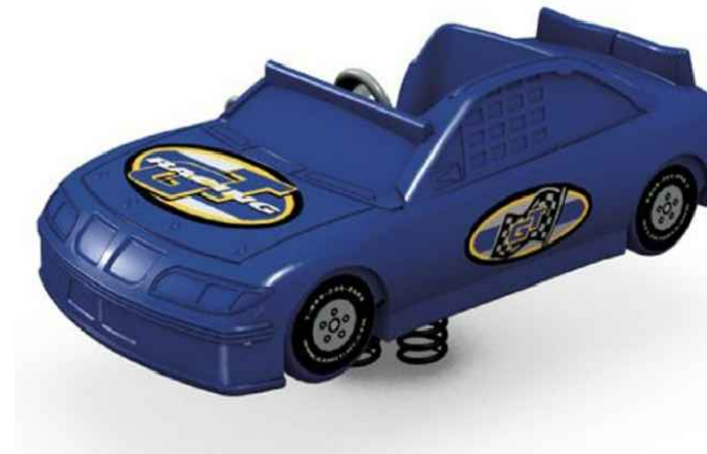
SPRING STOCK CAR TOTAL COST = $2,300 EACH