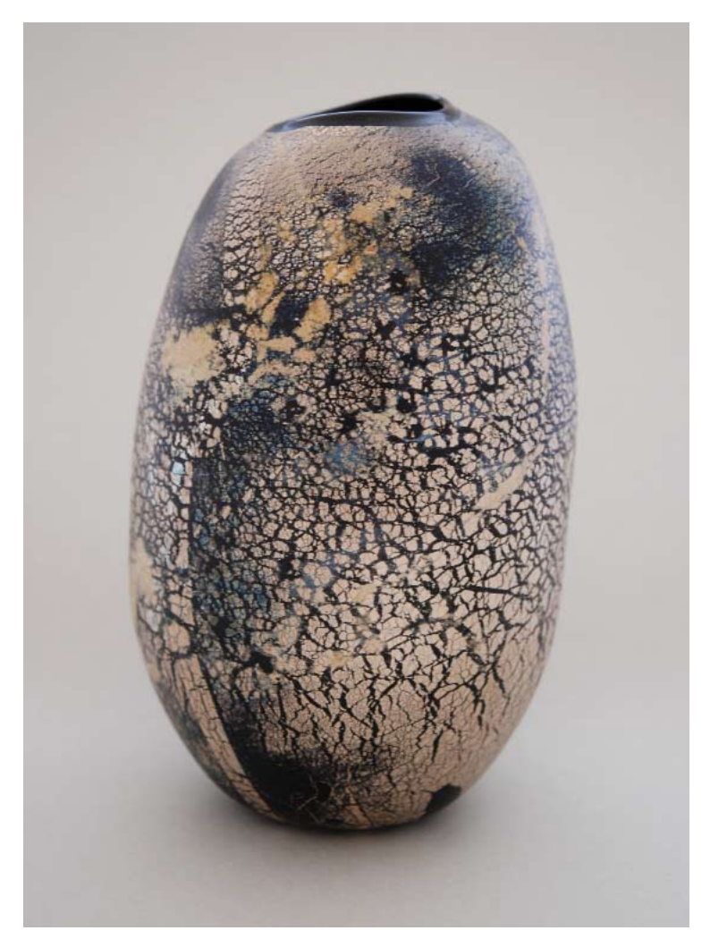
Glass Piece by Keith Weiskamp

"Ever since getting my hands on a blow pipe, I've been intrigued with the art and challenge of making vessels with unique patterns. With my current body of work, I've been exploring different patterns and textures that I can achieve with flat cones, murrini (a cane structure of fused pieces of colored glass) and heavy Japanese silver and gold foils. I'm fascinated with the idea of constructing vessels that I make 'hot' in the studio and then later deconstruct using various cold-working techniques."