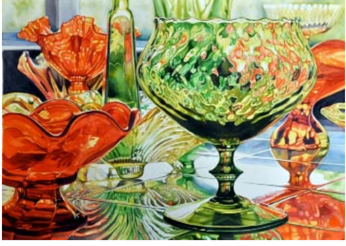
Dish by Cynthia Peterson

can reveal. My still life paintings use various glass objects chosen for their shape, color, clarity, and pattern. Different light sources are used to manipulate color, temperature and reflections on the shiny surface. This allows me to push color in very dramatic and oftentimes very abstract manner. It is this combination of reality and abstract that inspires my work."