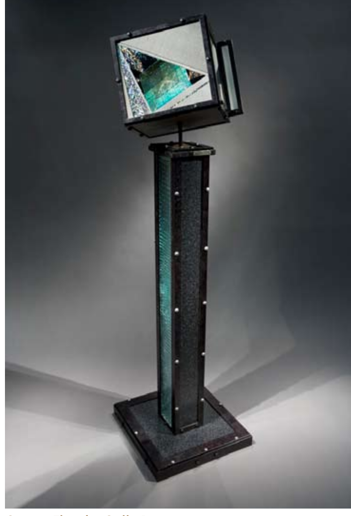
Oyster Flatt by Sally Dryer

"As an artist, I attempt to incorporate the science of kaleidoscopic mirror systems with the mysterious and natural marvels of the world around me. Each of my unique sculptures is made mainly of glass and wood. They are stylized landscapes that contain impressionistic elements, creating a personalized visual journey, tricking your eye into seeing something that extends beyond the frame and ideally stimulating your imagination. I call my art form 'captures.' They are frozen moments in time designed to inspire wonder and reflection."