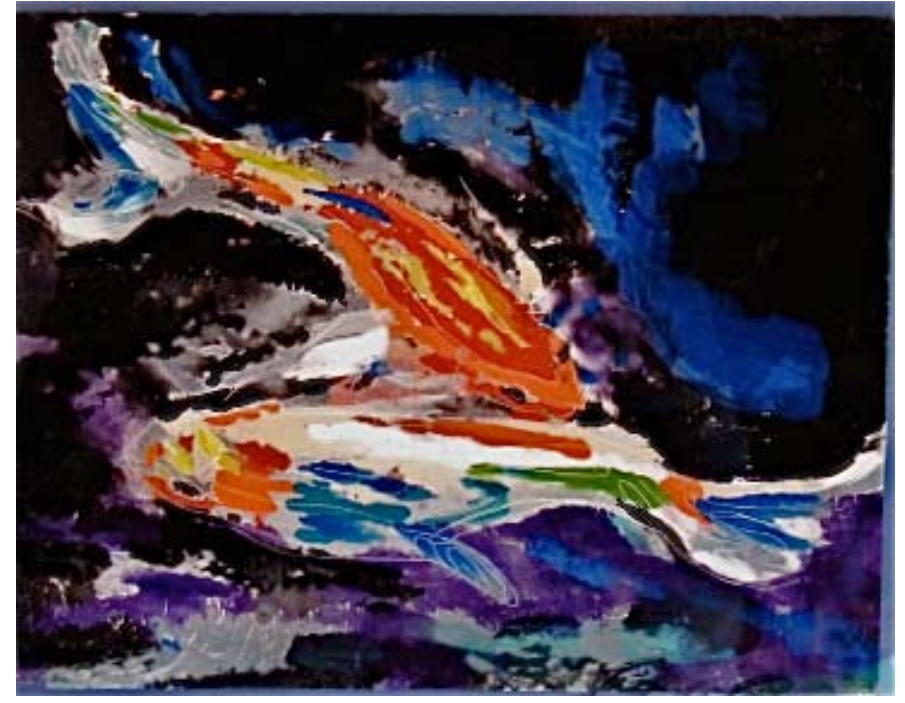
The Beauty of Nature by Pamela Ross

"My art is a continuing exploration of use of space, color and