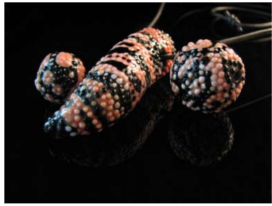
Monster Beads by Laurie Nessel

"With magnifying lenses blocking everything outside the flame, I become completely absorbed in coaxing form out of molten glass. Flame-