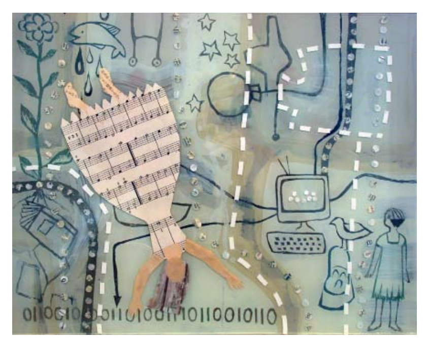
Get Comfortable Falling by Angela Cazel Jahn

When asked how her non-conventional glass works fit into the Biennial, the artist replied, "I was surprised that painting and applying collage to several layers of glass to build up an image isn't a more common process... the exhibition features glass work from traditional and contemporary genres, but it also includes experimental trails such as the work I submitted."